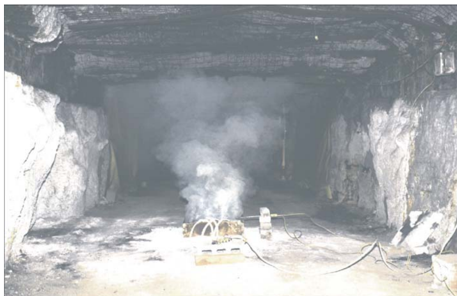
Figure 2.—Smoldering coal fire test in the Safety Research Coal Mine.