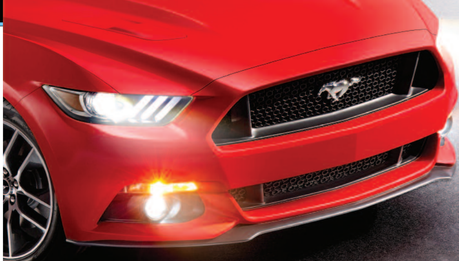
The 2015 Ford Mustang's bumpers, fenders and rear decklids are ideal target areas for using the F3T technology.