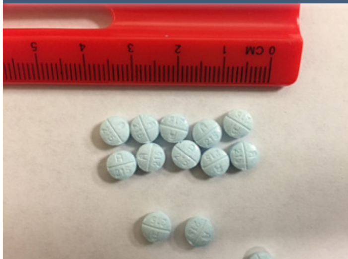
Figure 3: Counterfeit 30 Milligram Oxycodone Pills Containing Fentanyl.