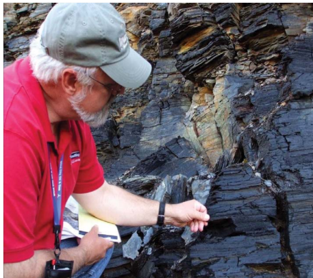
Natural gas is sometimes trapped inside of organic rich black shale (source: http://geology.com/energy/shale-gas/ ). Photo courtesy of ALL Consulting.

Consequently, shale resources are contributing to a rejuvenation of domestic natural gas supply in the United States. The U.S. Energy Information Administration (EIA) reports that U.S. shale gas production has increased 12-fold over the last decade and reserves have increased substantially, and now constitute about 19 percent of technically recoverable domestic natural gas. Shale gas ( 23 percent of the total), coalbed methane and tight gas combined now account for 58 percent of U.S. production . This increased domestic supply has helped reduce the need for imports while enhancing U.S. energy security.