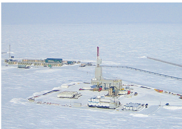
Gas Hydrate test well; Alaska North Slope, April 2011

In 2008, the U.S. Minerals Management Service identified 6,700 trillion cubic feet (tcf) of gas in favorable hydrate accumulations offshore in the Gulf of Mexico. A U.S. Geological Survey assessment indicated another 85 tcf of recoverable resources on the Alaska North Slope. Comparatively, U.S. technically recoverable natural gas resources are estimated at 2,552 tcf . FE field projects in Alaska (2007) and the Gulf of Mexico (2009) have provided initial confirmation of these assessments.