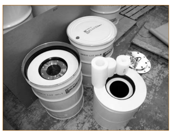
Example of containers used to store Transuranic Waste.