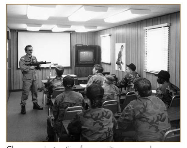
Classroom instruction for security personnel.

The Bonneville Power Administration (Bonneville) owns and operates six aircraft: four helicopters and two fixed-wing aircraft. Our review disclosed that Bonneville had not recently conducted a review to assess the continuing need for all of its aircraft or reported on the cost effectiveness of its aircraft operations. We recommended that Bonneville routinely evaluate the accuracy and reliability of passenger flight cost comparison data and assumptions; periodically review aircraft operations to determine the continuing need for all aircraft; and, prepare and submit an annual Capital Asset Plan to the Office of Aviation Management by the end of FY 2008. (OAS-L-08-14)