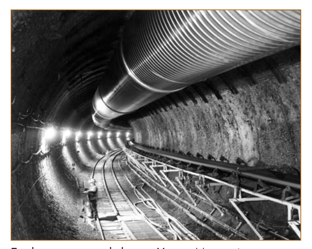
Exploratory tunnel dug at Yucca Mountain.

We also found that a fully written record memorializing the key decision points underlying its 2007 procurement strategy and selection process had not been developed. In our opinion, the public interest would have been better served had the Department done more to document the key decision points related to the selection process. (DOE/IG-0792)