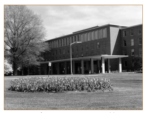
Department of Energy Germantown Building Germantown, Maryland

Our review disclosed that the Office of Science's Chicago Office (Chicago) had not corrected all previously reported weaknesses in monitoring and administering the SBIR II grants program. Action had not been completed to resolve 50 percent of approximately $2.4 million of questioned costs