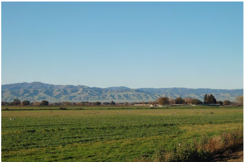
San Joaquin River NWR, CA, has been important in the recovery of Aleutian cackling goose and riparian brush rabbit populations.

Service staff evaluate potential land acquisitions to support the strategic growth of the National Wildlife Refuge System. By using landscape-scale conservation planning aids such as models of species-habitat interactions and decision support tools, Service staff can prioritize conservation and/or management actions needed to support or attain sustainable fish and wildlife populations at desired levels. Coordinating local actions with State and regional conservation goals improves the success of conserving large, connected natural areas. By working together, the Service and its conservation partners can accomplish much more than working as separate entities.