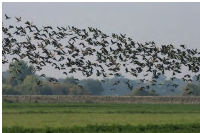
During the month of January, numbers peak for geese, cranes, and ducks in the San Joaquin River valley.

Established in 1987, the San Joaquin River NWR has an endangered species focus to protect the wintering grounds of Aleutian Canada (cackling) geese. The population of the cackling geese has significantly increased since the establishment of the Refuge, resulting in its delisting and becoming a game species for sportsmen. The other major endangered species focus for the Refuge is the riparian brush rabbit, perhaps the most endangered mammal in California. As very little of the species' dense riparian habitat remains, the Recovery Plan requires three new self-sustaining populations; acquisition of needed habitat is a key element for this species' recovery. The Service continues to acquire conservation easements to protect these species and their habitats, having most recently acquired a conservation easement on 501 acres of predominantly native, irrigated pasture.