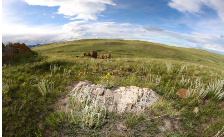
Rocky Mountain Front Conservation Area acquisitions will protect diverse and intact ecosystems allowing ranchers remain on working lands.

In implementing the recommendations of the NWRS's Conserving the Future vision document, the Service has narrowed the criteria it uses to evaluate proposed refuges and prioritize land acquisitions for existing refuges. The new criteria, which are in the draft Strategic Growth policy, will be incorporated into a new project scoring tool that the Service is developing. The new project scoring tool will replace the Land Acquisition Priority System (LAPS).