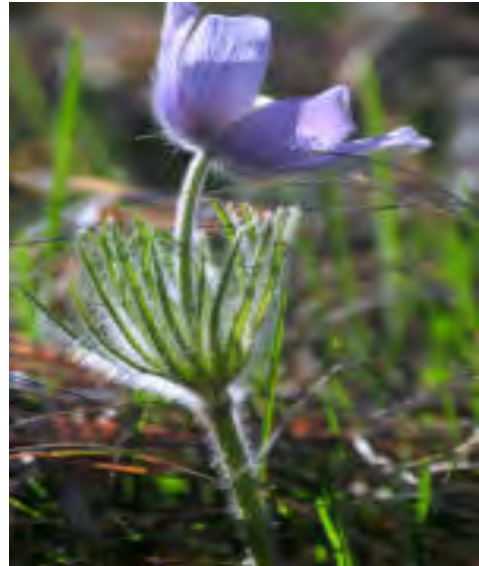
A pasque flower in the South Dakota prairie in the heart of the Dakota Grassland Conservation Area.

More than 47 million people visited National Wildlife Refuges in 2013, supporting local tourism, which supports local economies as visitors stay in local lodges, eat at local restaurants, and shop in local stores.