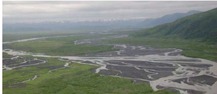
Long Beach River, Anchor Bay, within Alaska Peninsula NWR.

management. The acquisitions will reduce habitat fragmentation and will facilitate the Service's efforts to control invasive species. The exchange at Alaska Peninsula NWR established the eastern bank of the Long Beach River as the eastern boundary of the Refuge, creating a clear boundary between Refuge lands and Alaska Native Corporation lands, which will reduce trespass issues. The land exchange also provided the only feasible access to the Native Corporation lands in the upper Kametook River area, improving land management.