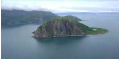
Chiachi Island is in the background and Shapka Island, part of the Alaska Peninsula NWR, is in the foreground.

The Alaska Peninsula and Alaska Maritime NWRs recently completed land exchanges with two Alaska Native Corporations. At Alaska Maritime NWR, land exchanges significantly improved management of the Jacob, Paul, and Chiachi Islands by eliminating mixed ownership and consolidating land