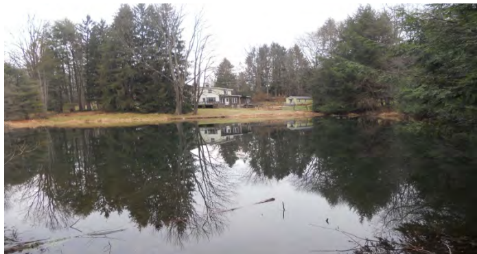
Newest acquisition for Cherry Valley NWR, new office/intern quarters in background and cold water pond for public fishing.

Nestled at the foot of the north slope of the Kittatinny Ridge, the property includes a diverse mix of habitats, including hemlock and rhododendron forest, oak-hickory hardwood forested slopes, black cherry and red cedar scrublands, red maple swamp, emergent wetlands, and the riparian corridor of a native trout stream. The area provides important habitat for migratory birds and an array of wildlife.