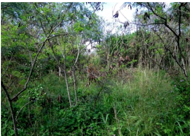
Latest acquisition on the James Campbell NWR and possible site for a future Visitor Center and Headquarters Office.

The Refuge is working with partners to restore a more natural scrub/shrub community on the property through removal of invasive plants and planting of native plants.