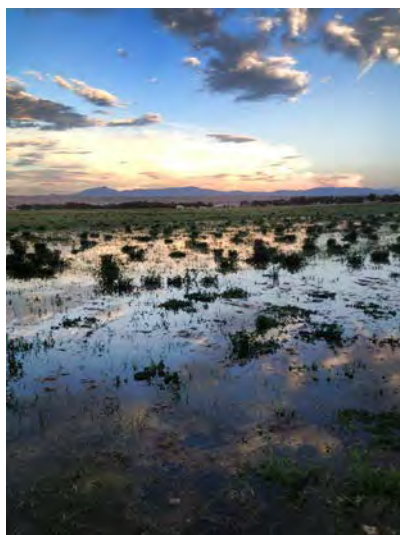
Newest acquired land as part of Valle de Oro NWR.