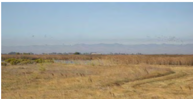
Waves of grass in the San Joaquin River valley.

The Grasslands WMA is located in western Merced County, California, within the San Joaquin River Basin. The Basin supports the largest remaining block of contiguous wetlands in the Central Valley. These wetlands constitute 30 percent of the remaining wetlands in California's Central Valley and are extremely important to Pacific Flyway waterfowl populations. The Service is continuing to acquire conservation easements to provide for the long-term viability of the grassland and wetland ecosystem, as well as to provide a safe haven for migratory birds and other wildlife. The most recent conservation easement is on 959 acres.