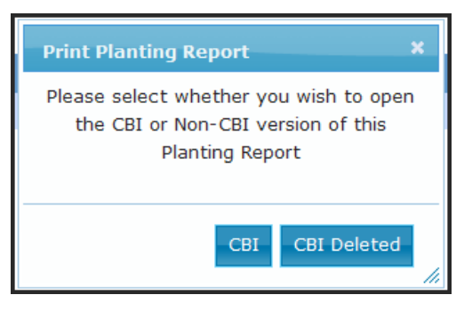
Figure 14: CBI Pop-up Window

26) The HTML report displays in a new window: