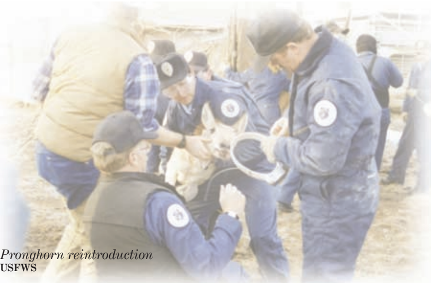
Pronghorn reintroduction USFWS