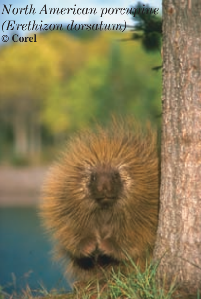
North American porcupine ( Erethizon dorsatum )