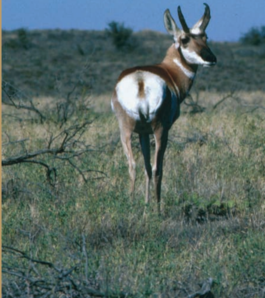
Pronghorn antelope (Antilocapra americana)