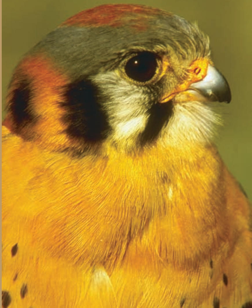
Kestrel falcon (Falco sparverius)

“To foster collaboration for the conservation of North American migratory birds to ensure the health and sustainability of shared bird populations while contributing to the conservation of biodiversity.”