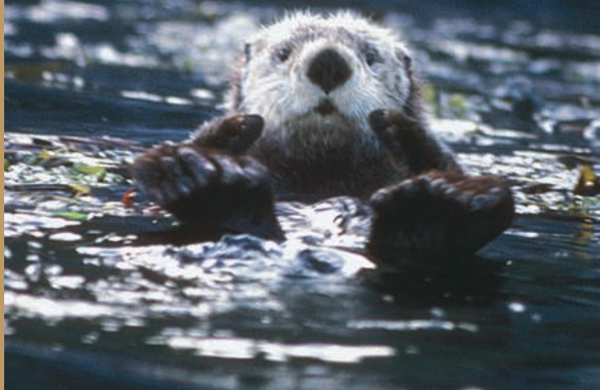
Sea otter (Enhydra lutris)

“Through North American collaboration and cooperation on CITES, this table works to exchange information, strengthen regional implementation and scientifically based decision making, in order to protect endangered species of wild fauna and flora against over-exploitation through international trade.”