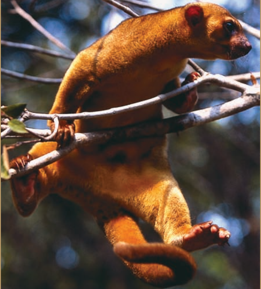
Kinkajou (Potos flavus)

Chan K'in Elder of the Lacandon People Chiapas, Mexico