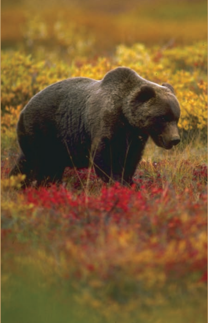
Grizzly bear (Ursus arctos)

Chief Seattle, Suquamish and Duwamish Native American Tribes Washington State, USA