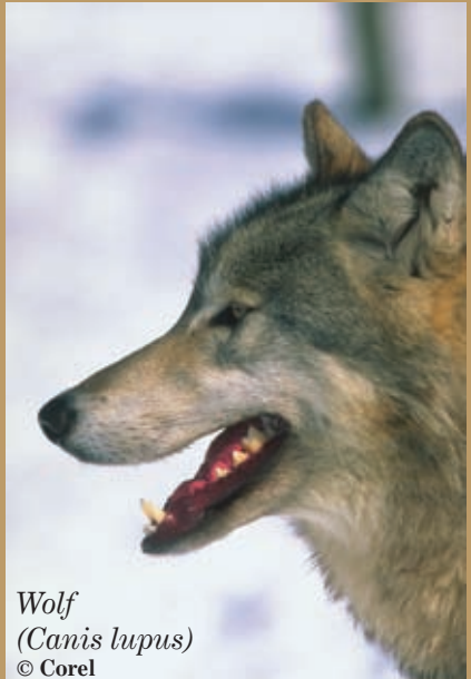
Wolf ( Canis lupus )