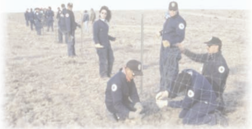
Fence installation USFWS