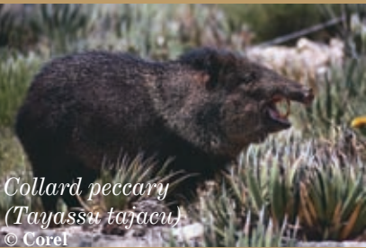
Collard peccary ( Tayassu tajacu )