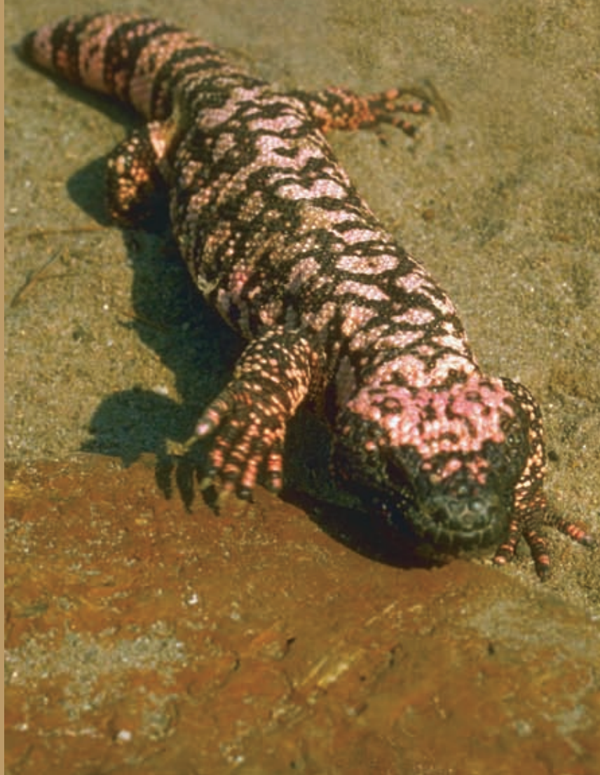
Gila monster (Heloderma suspectum)

“Through established operational and administrative structures, the North America Wildlife Enforcement Group (NAWEG) contributes to strengthening regional capacity to implement national laws and international agreements regarding wildlife, particularly CITES.”