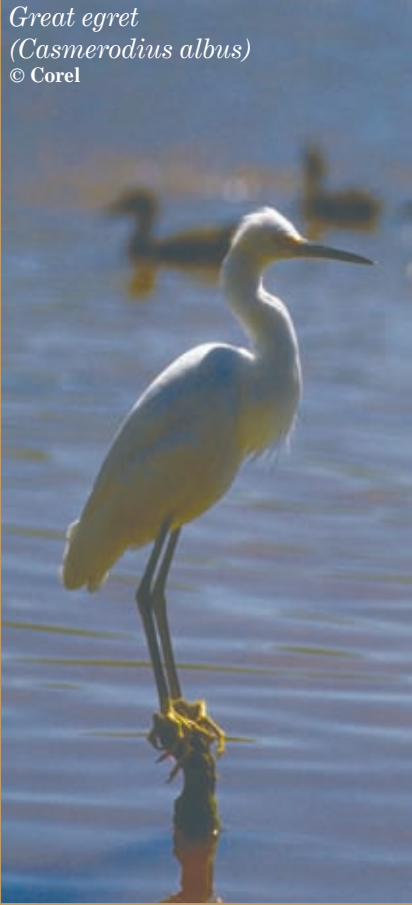
Great egret ( Casmerodius albus )