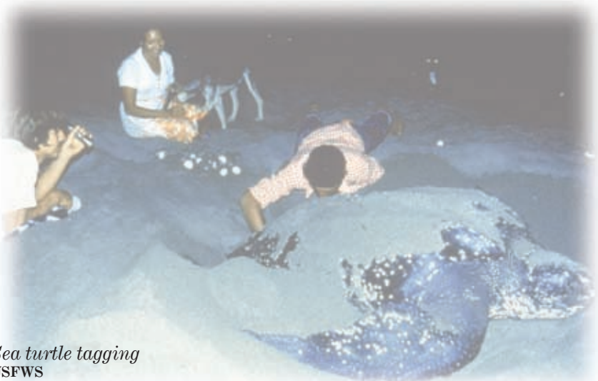
Sea turtle tagging

As a leading biodiversity conservation entity in North America, the Trilateral Committee provides an effective and efficient mechanism to address conservation and management of natural resources on a continental scale. Equally important are the many intangible accomplishments such as providing a unique forum to better understand the differing factors that influence national policies in each country. Working together, the partner nations comprising the Trilateral Committee can better face the challenges of moving towards a sustainable future for North America.