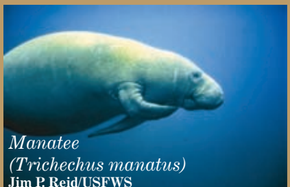
Manatee ( Trichechus manatus)