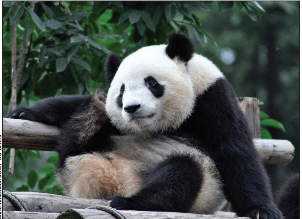
Chris Wilkinson CC BY-NC-SA 2.0

The primary goal of the policy is to ensure that permitted activities will directly contribute to the survival and recovery of the wild panda population. To accomplish this goal, the Service will review an application to determine that it is a proposal for scientific research,