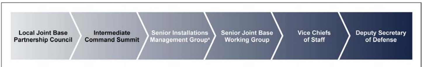
Figure 1: Joint Management Oversight Structure Levels and Decision Chain

The Joint Management Oversight Structure was established as a mechanism to provide for six levels of performance review and dispute resolution as part of managing implementation of the joint bases. Issues raised at the joint bases are first addressed at the lowest level of the structure, the local Joint Base Partnership Council, which includes officials from the supported and supporting services on each joint base. If issues are not resolved there, they are raised to higher levels of command, such as the Senior Installation Management Group, which includes the service installation commands, such as Commander, Navy Installations Command, and the Army Chief of Staff Installation Management Command. If the issues remain unresolved, they can go up through the service Vice Chiefs of Staff and finally on to OSD. See figure 1 for the oversight structure and decision chain.