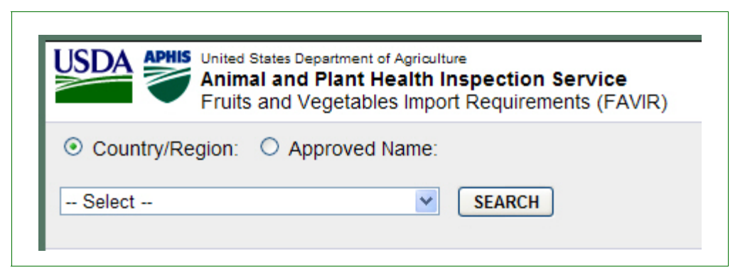
Figure 1 FAVIR Home Page Search Options

If you would like to see all of the commodities that are admissible from a particular county, click the radio button for "Country/Region", select the country in the drop down list, and click on "SEARCH". If you would like to see an alphabetic list of approved commodities, click on the radio button for "Approved Name", select the commodity in the drop down list, and click on "SEARCH".