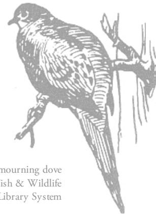
Illustration of mourning dove U.S. Fish & Wildlife Digital Library System