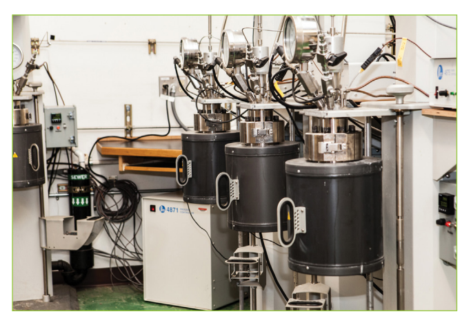
To better understand geologic formations, researchers at NETL's High-Pressure Immersion and Reactive Transport Laboratory in Albany are studying subsurface systems.

The overall objective of the Carbon Storage Program is to develop and advance carbon capture and storage (CCS) technologies both onshore and offshore that will significantly improve the effectiveness of the technologies, reduce the cost of implementation, and be ready for widespread commercial deployment in the 2025–2035 time frame. Technical and economic barriers must be addressed and data generated to inform regulators and industry on the safety and performance of CCS. NETL capabilities have been employed to pursue CCS goals in two technology component areas: (1) Advanced Storage Research and Development (R&D) and (2) Storage Infrastructure. A third area, Risk and Integration Tools crosscut these two areas.