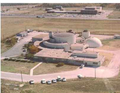
CP-5 Reactor Site and Decommissioning Activities