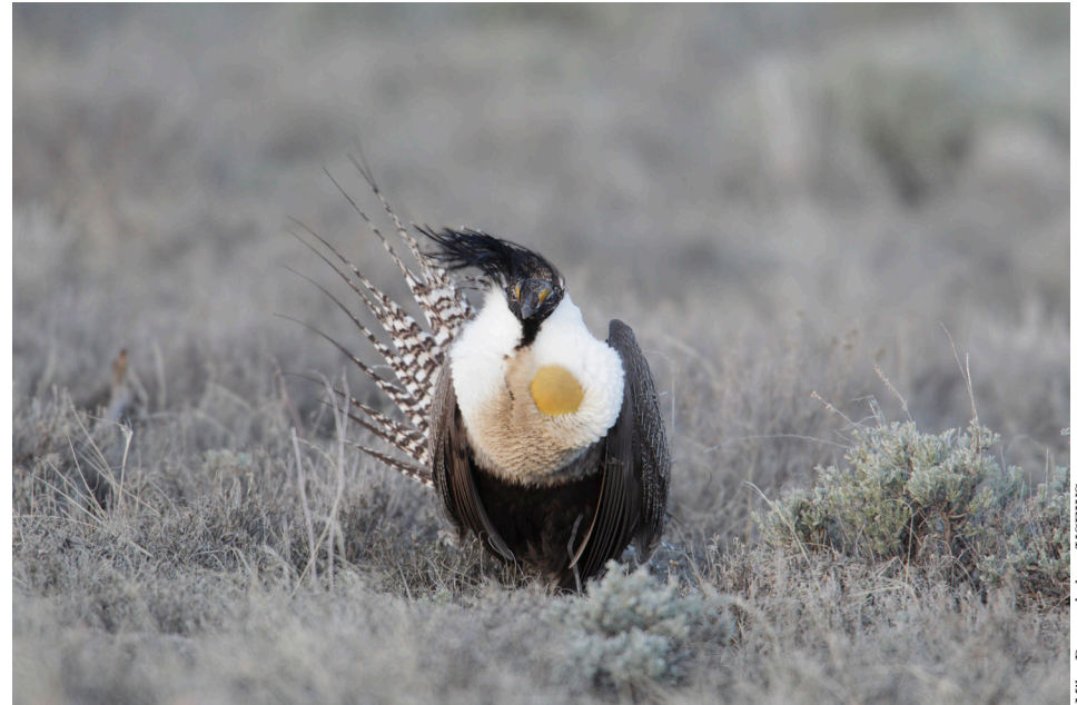
Gunnison sage grouse.

The foundation supporting recovery plans is a Species Status Assessment (SSA). A SSA includes much of the information and analyses previously