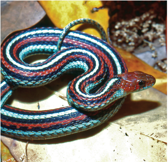
San Francisco garter snake

If imperiled plants and animals lack a known benefit to mankind, should we care if they disappear? If a species evolves over millennia or is created by divine intent, do we have a right to cause its extinction? Would our descendants forgive us for exterminating a unique form of life? Such questions are not exclusive to scientists or philosophers. Many people believe that every creature has an intrinsic value. The loss of plant and animal species, they say, is not only shortsighted but wrong, especially since an extinct species can never be replaced. Eliminating entire species has been compared to ripping pages out of books that have not yet been read. We are accustomed to a rich diversity in nature. This diversity has provided inspiration for countless writers and artists, and all others who treasure variety in the natural world.