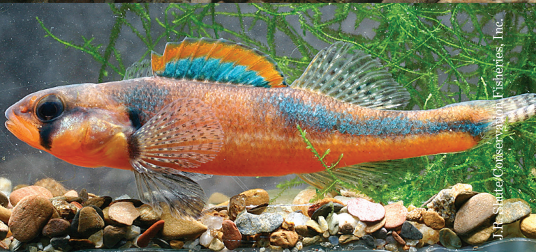
J.R. State/Conservation Fisheries, Inc.