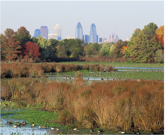
John and Karen Hollingsworth

One example of an ecosystem service not widely known is that plants remove, transfer, stabilize, and destroy contaminants in soil and sediment. Certain plant species have the ability to extract elements from the soil and concentrate them in the easily harvested plant stems, shoots, and leaves. The alpine pennycress, for example, doesn't just thrive on soils contaminated with zinc and cadmium; it cleans them by removing the excess metals. In the home, houseplants under some conditions can effectively remove benzene, formaldehyde, and certain other pollutants from the air.