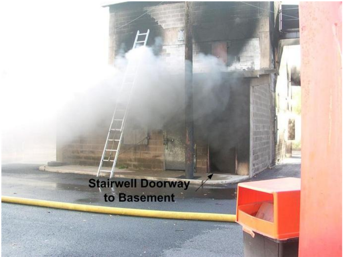
Photo 2. Burn Building D-Side Conditions during the Incident