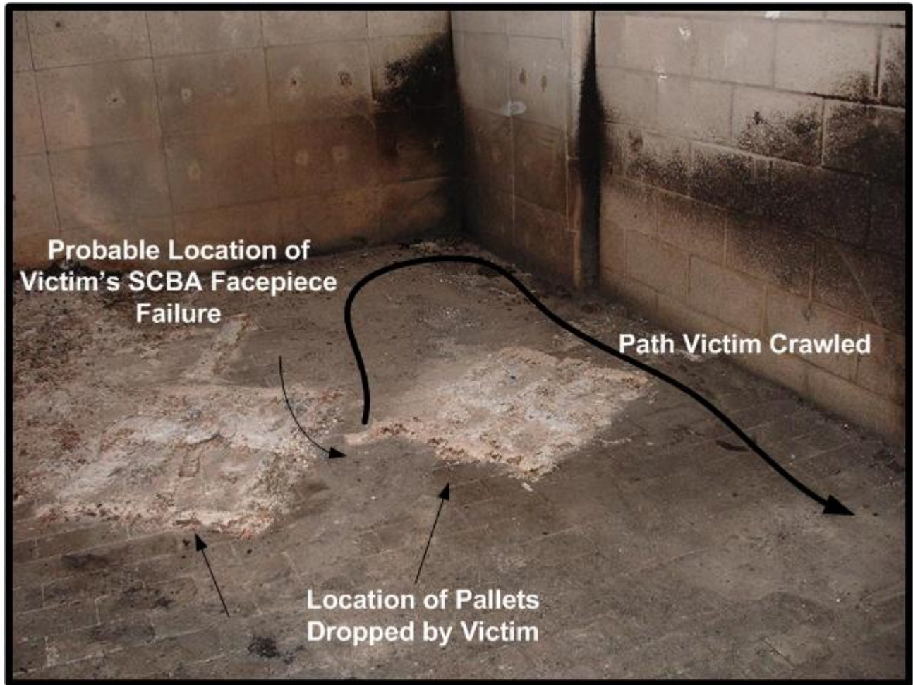
Photo 3. Basement Burn Room after Incident.