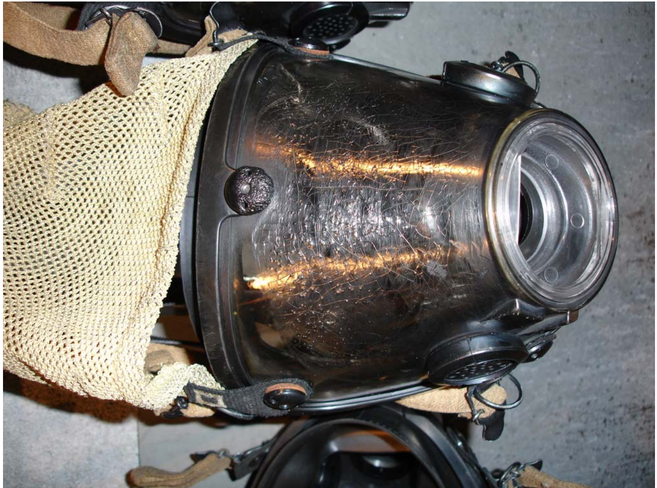
Photo 4. Another SCBA Facepiece Exhibiting Conditions Similar to the One Worn by the Victim