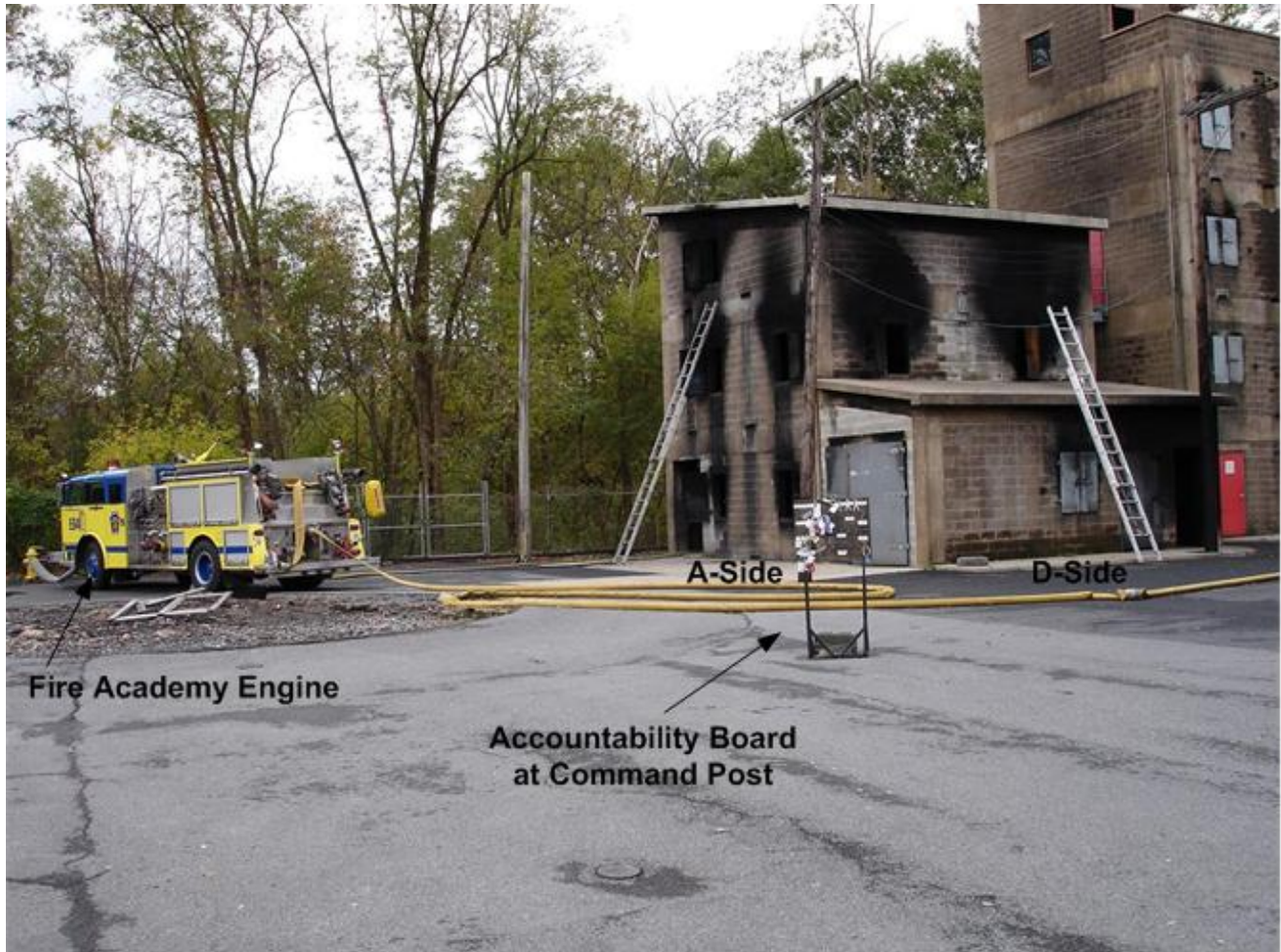
Photo 1. Residential Burn Building at Fire Academy Showing Incident Scene.