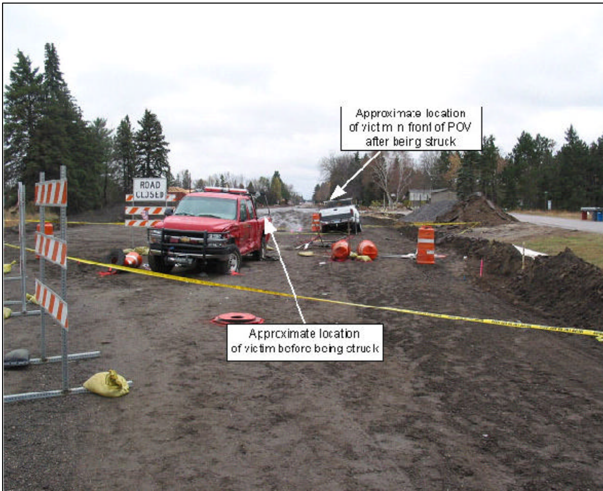
Photo 2. Incident Scene