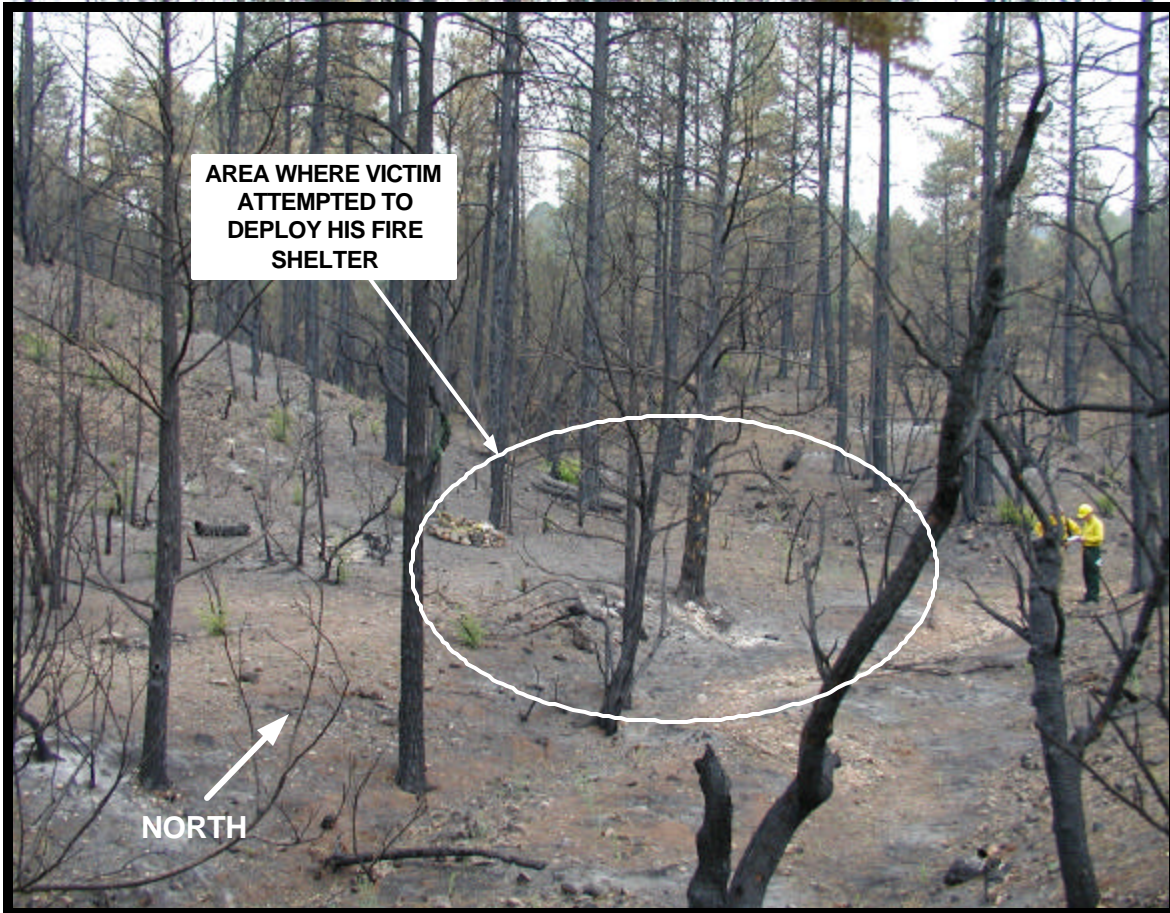
Photo 2. View of deployment area looking up drainage