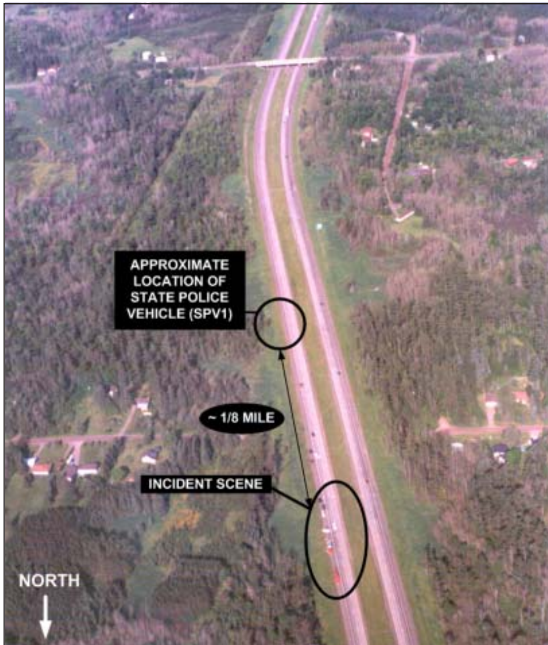
Photo 1. Aerial View of Highway