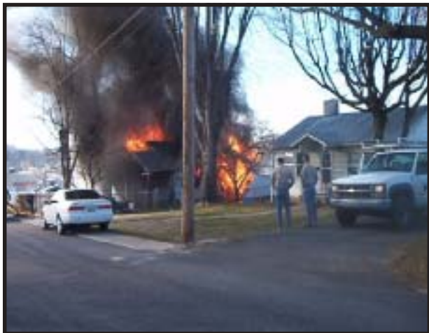
Site of the Incident

The Fire Fighter Fatality Investigation and Prevention Program is conducted by the National Institute for Occupational Safety and Health (NIOSH). The purpose of the program is to determine factors that cause or contribute to fire fighter deaths suffered in the line of duty. Identification of causal and contributing factors enable researchers and safety specialists to develop strategies for preventing future similar incidents. The program does not seek to determine fault or place blame on fire departments or individual fire fighters. To request additional copies of this report (specify the case number shown in the shield above), other fatality investigation reports, or further information, visit the Program Website at