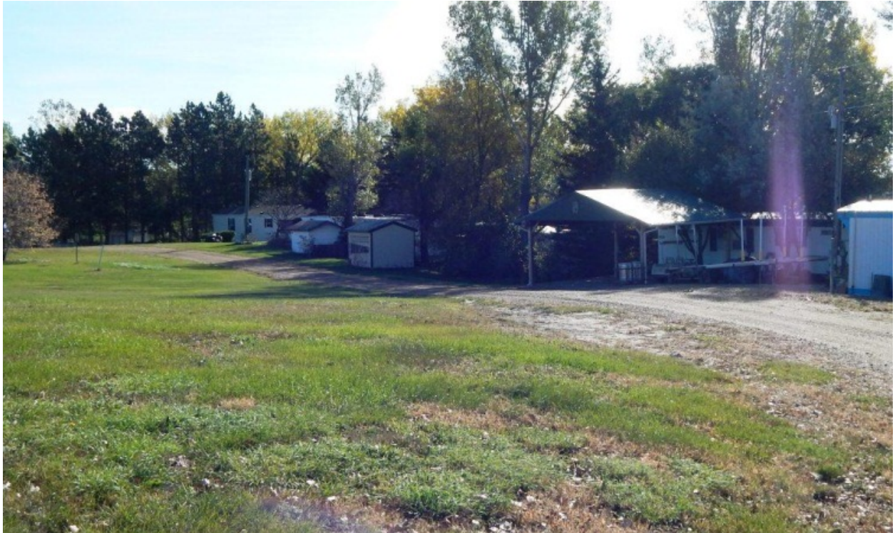
This picture was taken looking east from a public area within Northside Trailer Area 2. On the right side of the road, from far to near, are glimpses of lots in ascending order from Site 34 to Site 39.