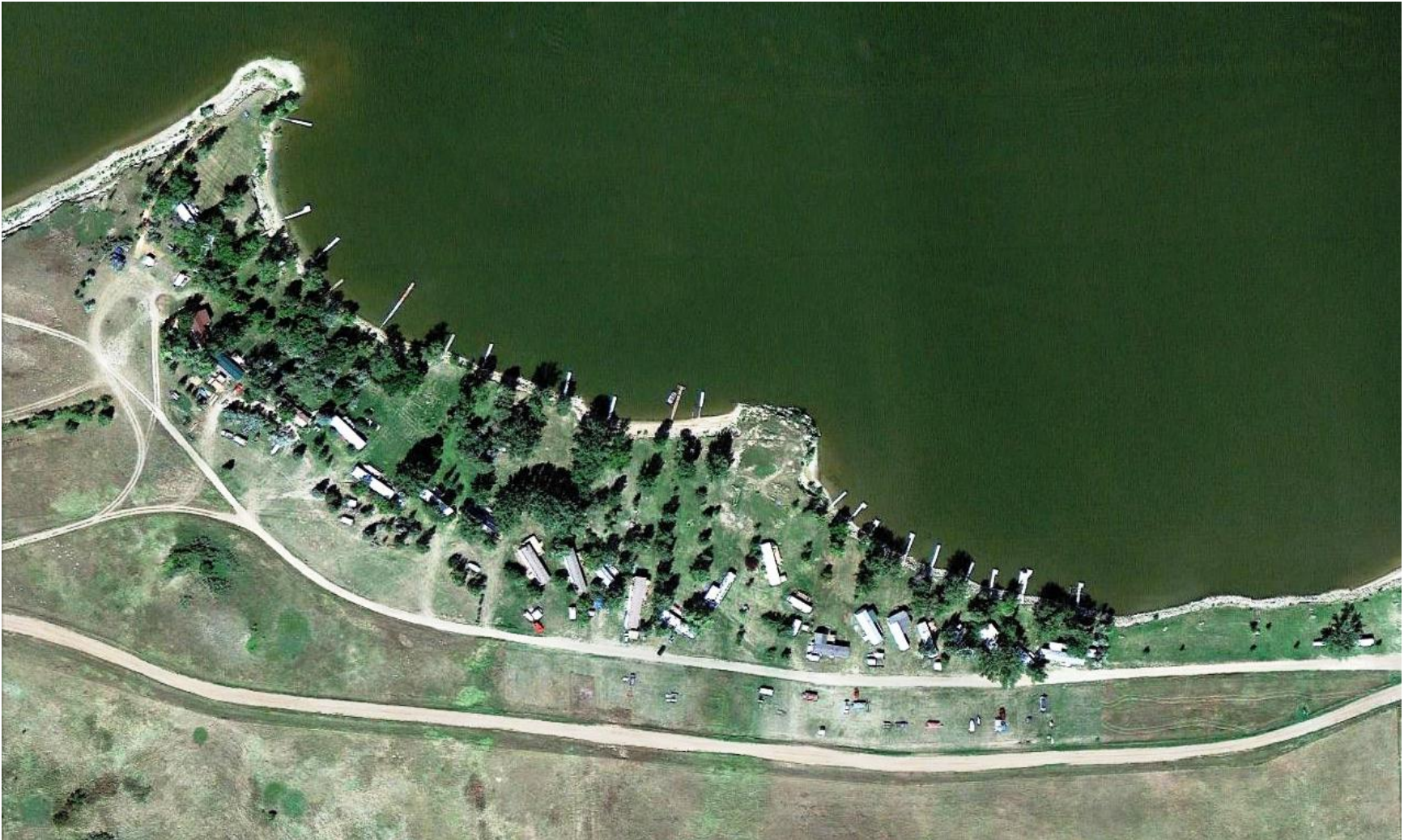
This is an aerial of the Southside Trailer Area.