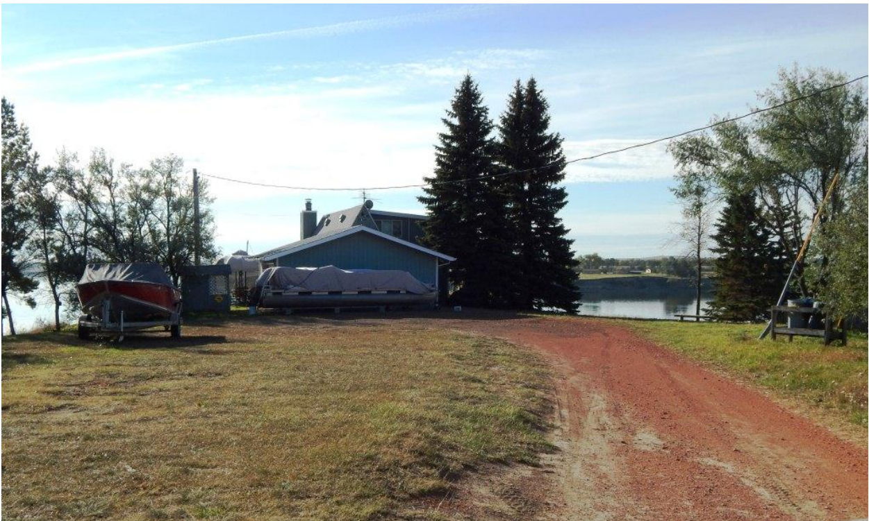
Pictured is the cabin occupying Site 42 of Cabin Area 2. The shot was taken looking south.