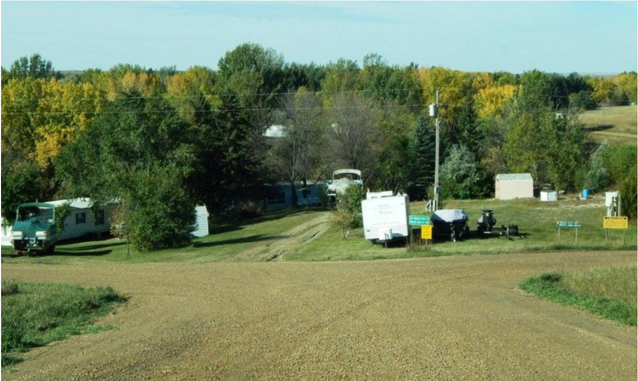
This picture was taken at the entrance to Northside Trailer Area 1. At the bottom of the hill, from left to right, are Trailer Sites 38-40. The picture was taken looking west.