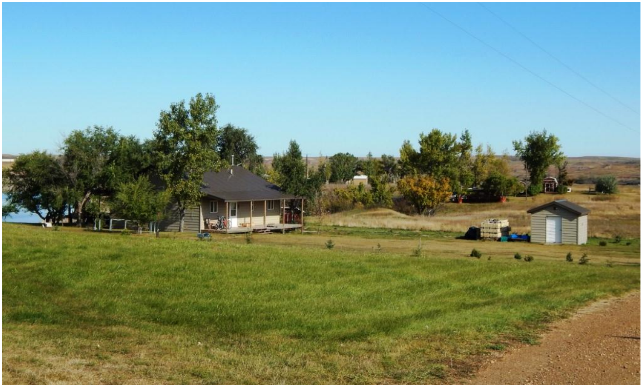
Pictured is Site 2 of Cabin Area 1. The picture was taken looking north. The cabin sitting atop Site 4 can be seen in the background, as can one of the numerous structures occupying Site 7.