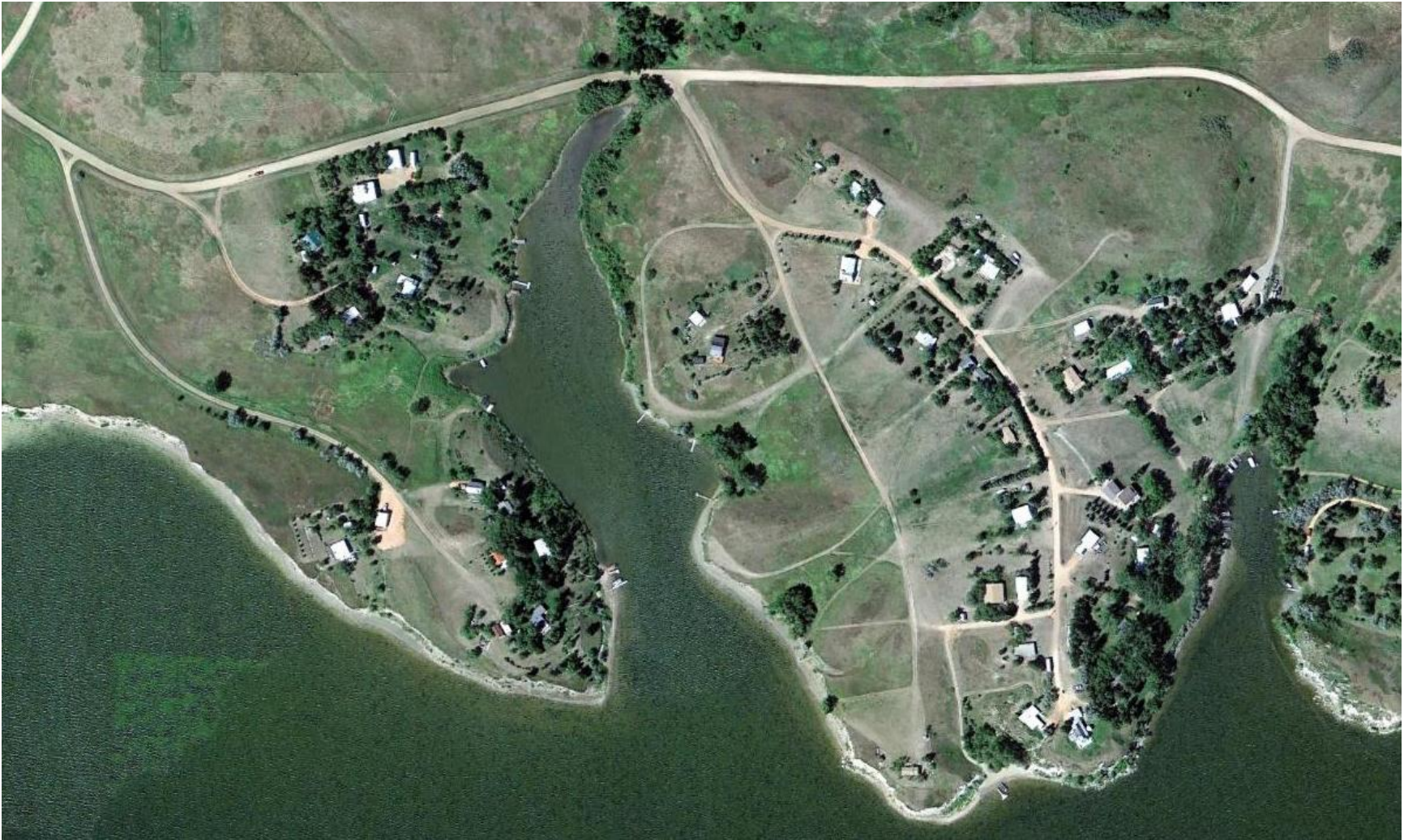
This is an aerial view of Cabin Area 2.