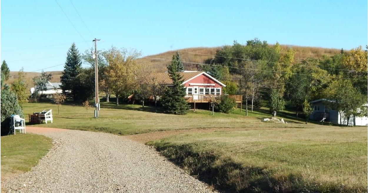
This picture looks north at Cabin Sites 27 and 32 in Cabin Area 2. Cabin Site 30 can be seen in the background.