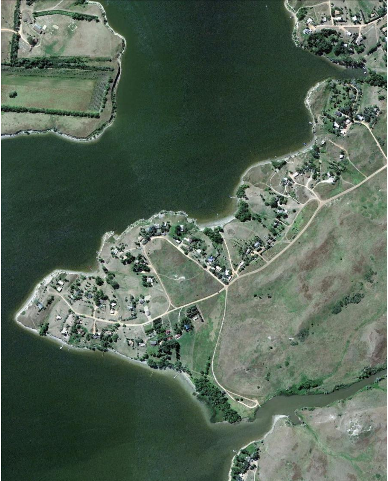
This is an aerial view of Cabin Area 3. In this picture due north points to the right (west is up).