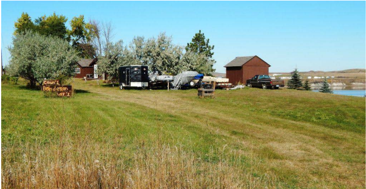
This picture was taken looking northwest at Cabin Site 1 within Cabin Area 1.