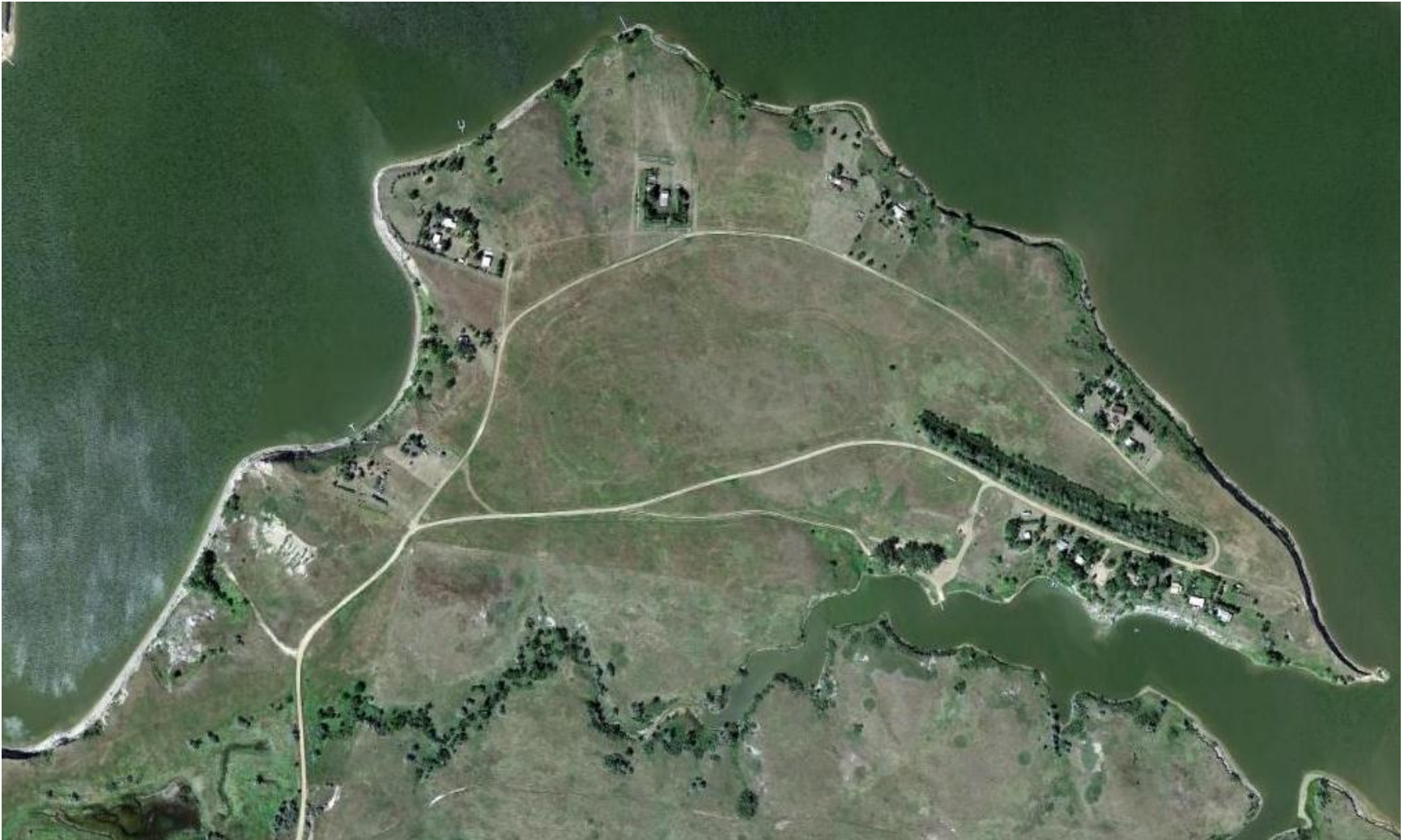
This is an aerial view of Cabin Area 1.