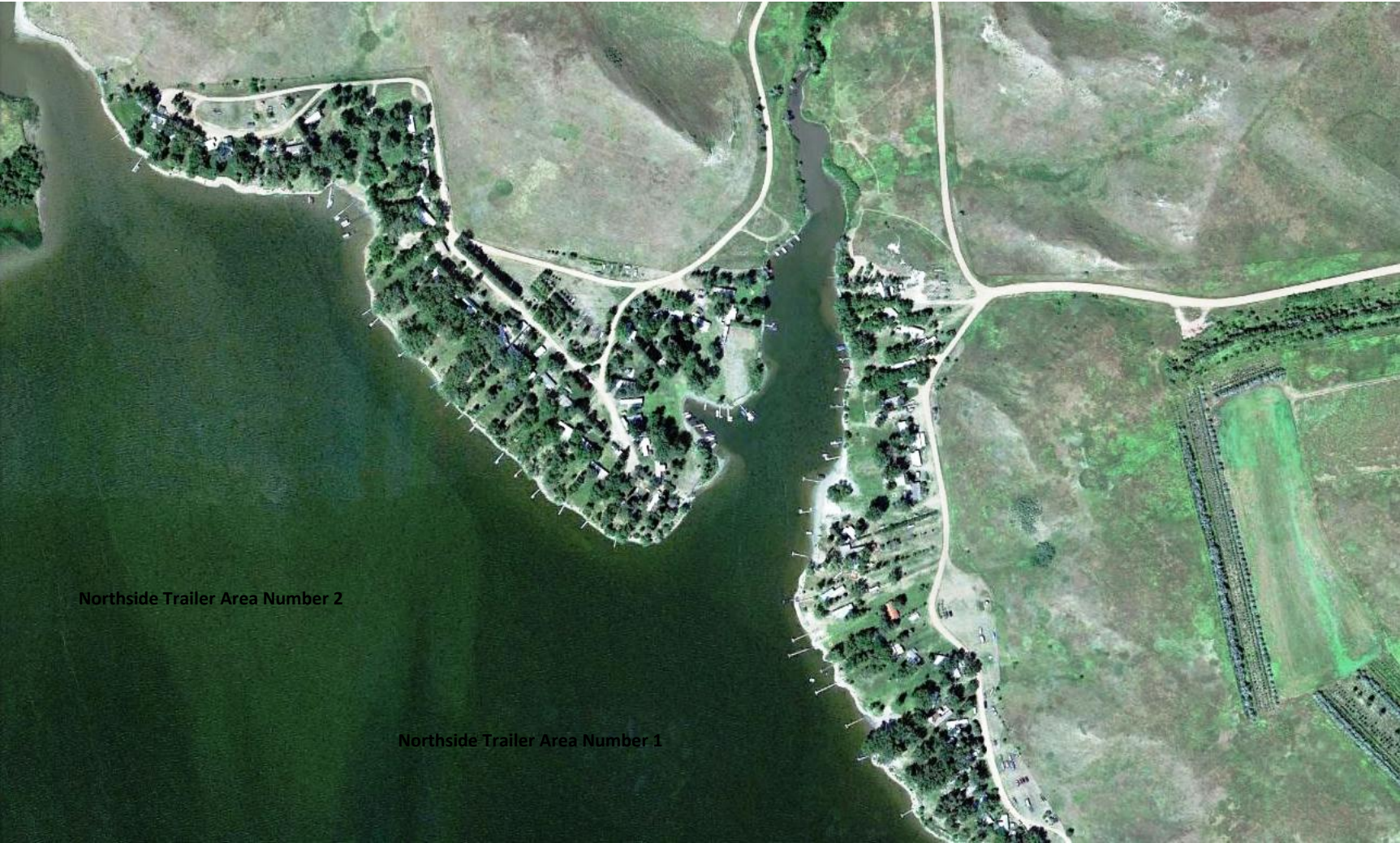
This is an aerial view of Northside Trailer Area 1 and Northside Trailer Area 2.