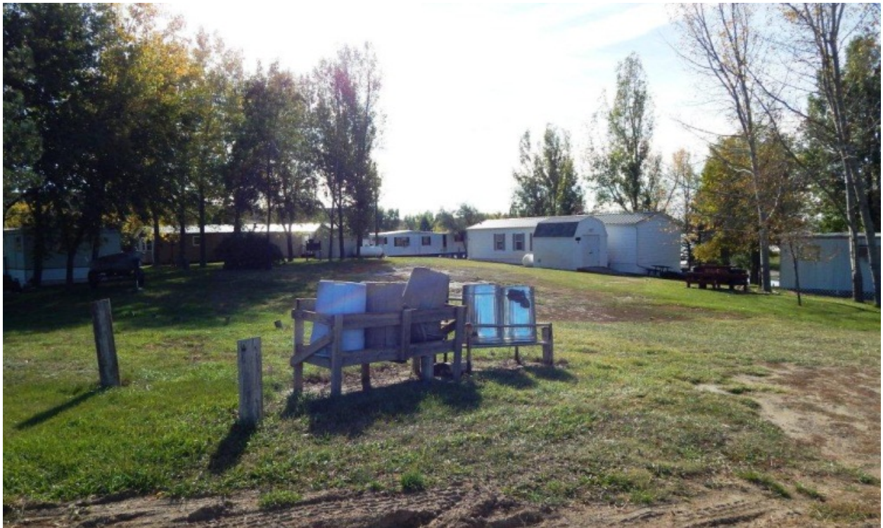
This picture was taken looking Southeast from within Northside Trailer Area 2. From left to right are the cabins occupying Sites 1 through 5.