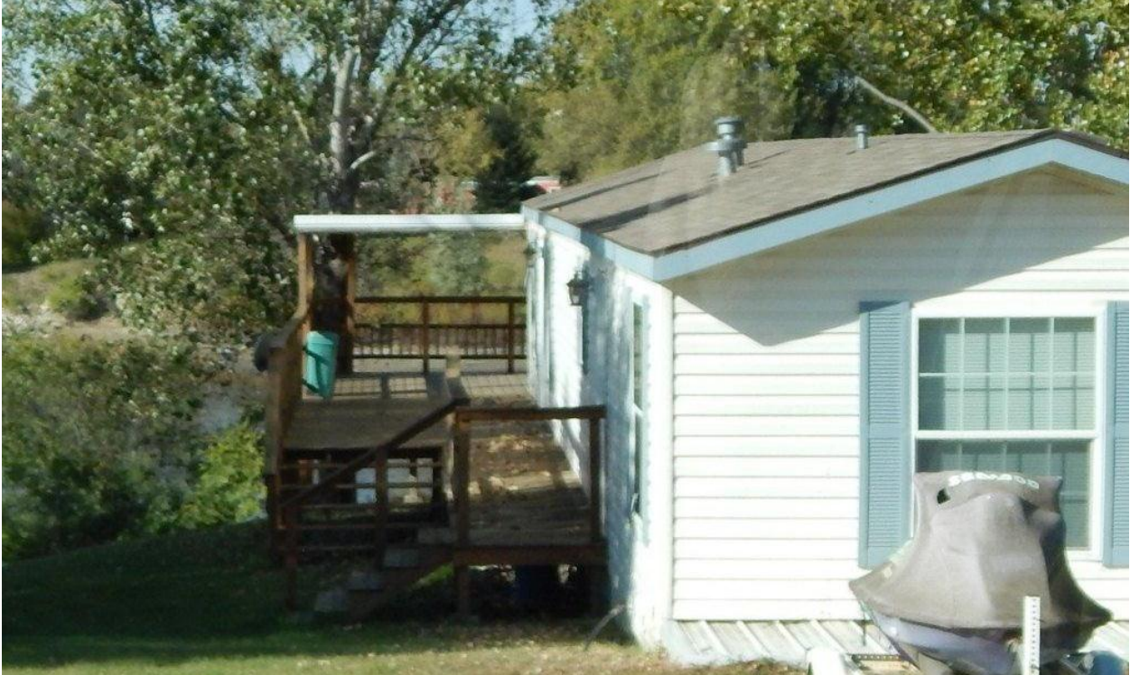
Looking west at Trailer Site 33 within Northside Trailer Area 1. The waterfront setting and the perpendicular positioning of the trailer is fairly typical for the narrow lots within this trailer area.