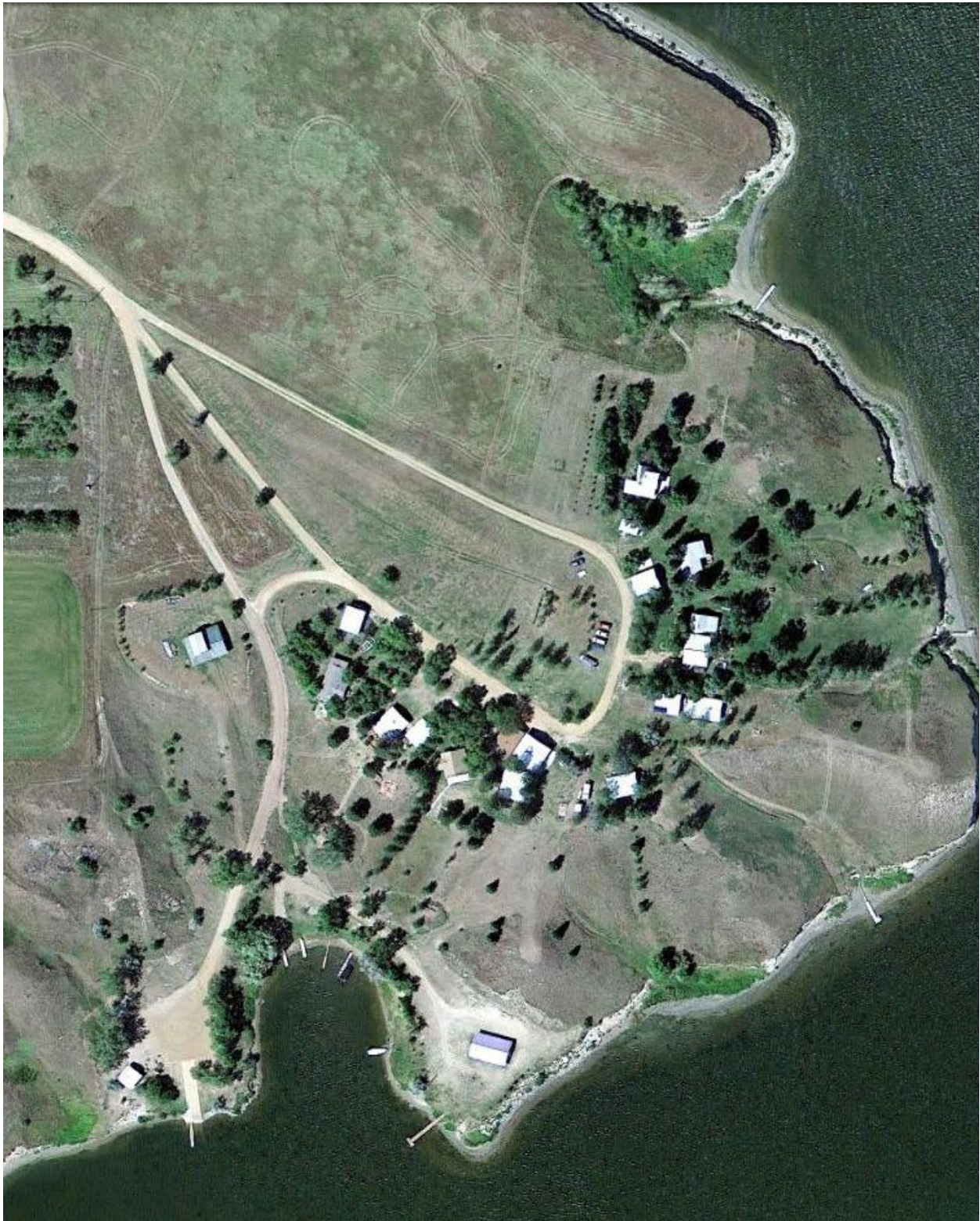
This is an aerial view of Cabin Area 4.