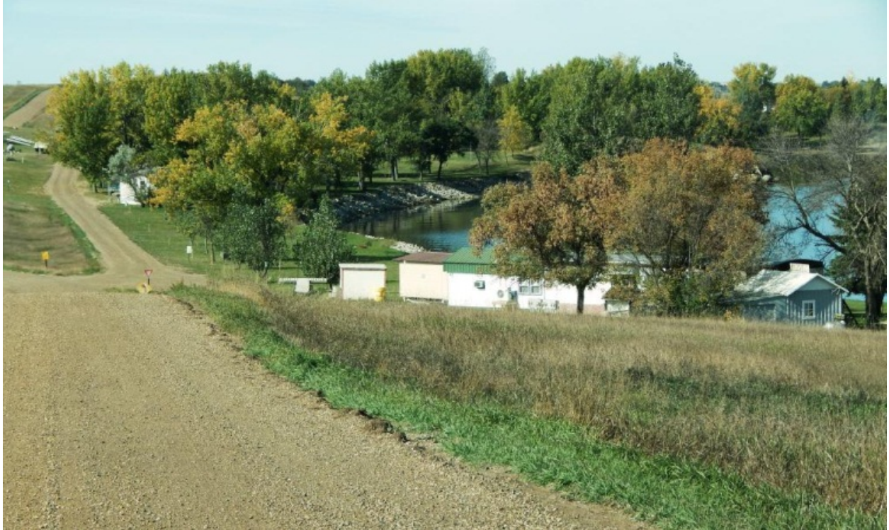
This picture was taken while looking Northwest at Cabin Site 1 within Cabin Area 1.