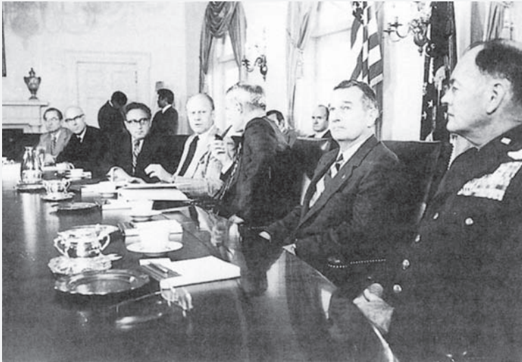
President Gerald Ford, flanked by Secretary of State Kissinger and Defense Secretary Schlesinger, presides over an NSC meeting. DCI Colby is seated at the far left.

Outside the formal NSC structure, however, Colby had few contacts with Ford and, thus, little direct personal knowledge of the issues the president was concentrating on at a given time and his intelligence needs. Colby described the situation this way: “My own reluctance to push into the Oval Office unless I was invited or had something that I thought demanded my personal presence, combined with a lively awareness of the probable reaction if I had tried to elbow past Henry Kissinger, kept me from pressing for personal access to either Nixon or Ford. In retrospect, I consider this one of the errors I made as Director, although I am not sure how I could have done any differently.” 21