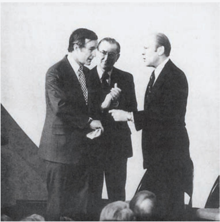
Former Ambassador George H.W. Bush receives congratulations from out-going DCI Colby and President Ford after his swearing in at the CIA Headquarters Auditorium.

There was no indication that Ford felt deprived after the daily PDB sessions ended. At the CIA, however, the experience of 14 months of daily meetings with the president, contrasted with the succeeding months without those meetings, confirmed vividly the stark truth that there is no substitute for direct access to the president.