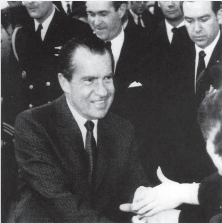
President Richard Nixon greets CIA employees as DCI Richard Helms looks on.

Helms recorded that Nixon and Agnew were interested, in particular, in the effects of the Soviet-Czechoslovak confrontation on Poland and Yugoslavia. He also noted that they were surprised to hear the North Vietnamese were demanding that the Saigon government negotiate directly with the communist shadow administration in South Vietnam, the National Liberation Front. During the course of the briefing, Nixon directed a number of policy questions to Rusk. The Republican candidate made clear he had no intention of saying or doing anything that would complicate the job of the US negotiators in Paris.