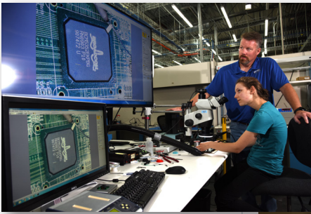
INL is a leading provider of national security solutions in areas including control systems cybersecurity, nuclear nonproliferation and defense systems.