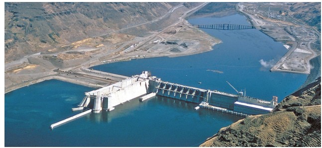
Lower Granite Dam — capacity 810 megawatts, energized in 1975

The Northwest Power and Conservation Council estimated the social costs of continued CO 2 emissions to the region over time. 4 Using the Council's social cost of carbon analysis, BPA estimates that replacing the four lower Snake River dams with gas-fired generation would have an associated social carbon cost of $98 million to $381 million each year.