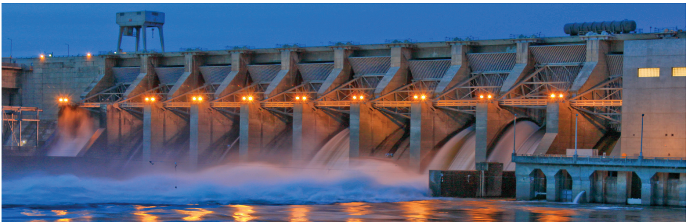
Ice Harbor Dam — capacity 603 megawatts, energized in 1961.

A key benefit of the federal dams is clean air. These dams produce a lot of energy and no greenhouse gas emissions. This gives the Northwest an environmental edge unmatched elsewhere in the country, where power production is largely based on fossil fuels.