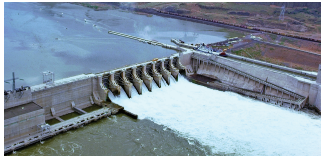
Lower Monumental Dam — capacity 810 megawatts, energized in 1969

The average energy output of a generator is also helpful when making comparisons. The four lower Snake River dams produce 1,004 average megawatts 5 each year. For comparison, the Boardman coal plant in Oregon provides 489 aMW. As an additional point of comparison, three