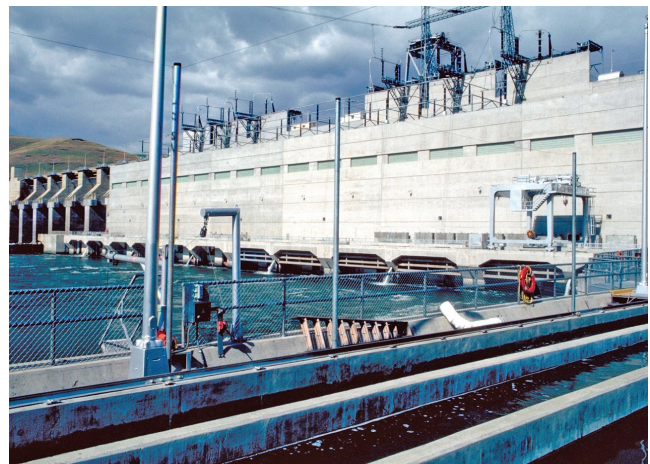
Little Goose Dam — capacity 810 megawatts, energized in 1970

The most technically and economically feasible generation replacement for the lower Snake River dams would likely be natural gas turbines. New natural gas generators could increase transmission congestion depending on their location, and would likely require additional transmission