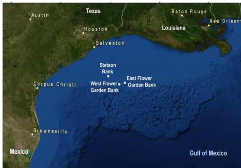
Flower Garden Banks National Marine Sanctuary is located in the northwestern Gulf of Mexico, about 70-115 miles south of the Texas/Louisiana border