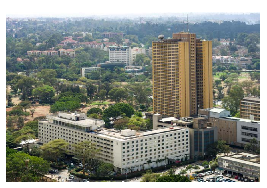
The Nyayo House in Nairobi became headquarters of Special Branch, whose leaders were consulted during construction.

As stories leaked out over the years, Nyayo House became known for torture and political suppression, which included arrests of students, professors, civil servants, and any