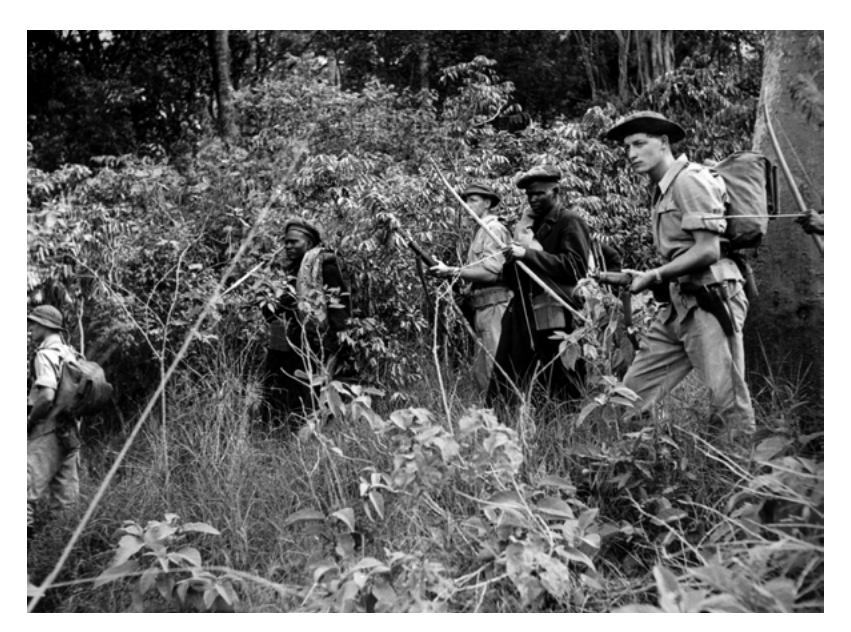
British and African soldiers on patrol during Mau Mau uprising. Date ca. 1951–55.