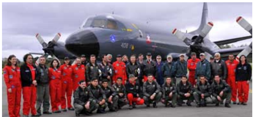
The GSFC/WFF Airborne Topographic Mapper (ATM) team with the Chilean Armada P3 aircraft crew stand for a group photo.