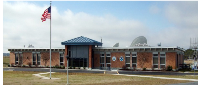
Wallops Command and Data Acquisition Station