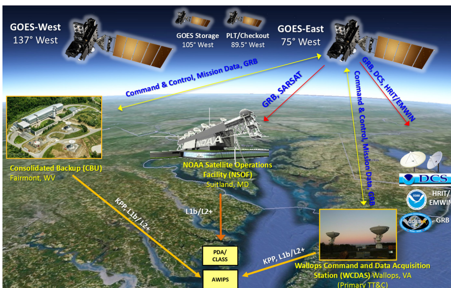
GOES-R Ground System Architecture