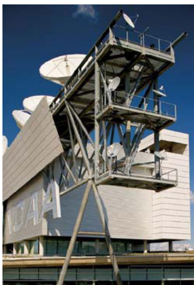
NOAA Satellite Operations Facility

Ground support is critical to the GOES-R mission. NOAA has developed a state-of-the-art ground system that will receive data from the GOES-R spacecraft and generate real-time data products. This is accomplished via a core set of functional elements which include space/ground communications, raw data processing, monitoring the satellite's health and safety, and commanding the spacecraft and instruments, as well as a new antenna system and a product access component.