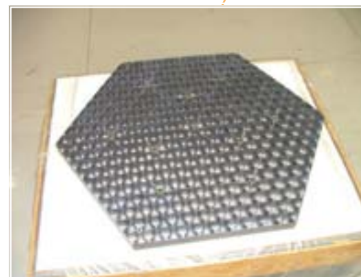
The back of a beryllium mirror blank is machined with precision so it will be lightweight yet structurally sound.