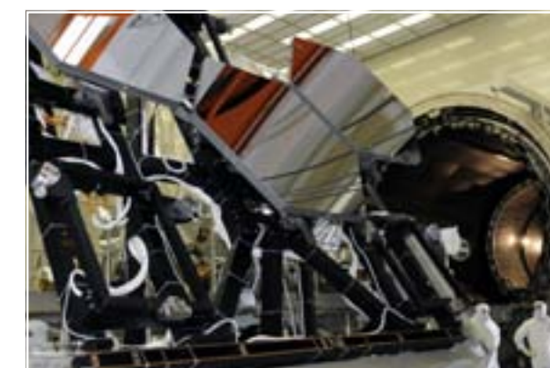
Three mirror segments about to undergo cryogenic testing at Marshall Space Flight Center.