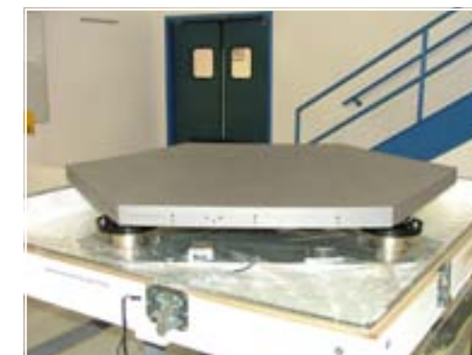
The uncoated front side of one of Webb's mirror segments.

The James Webb Space Telescope is a joint project of NASA, the European Space Agency and the Canadian Space Agency.