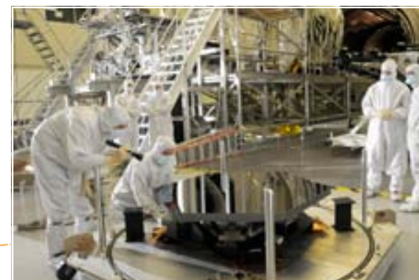
Engineers from Ball Aerospace inspect the first mirror segment upon its arrival at Marshall Space Flight Center for cryogenic testing.