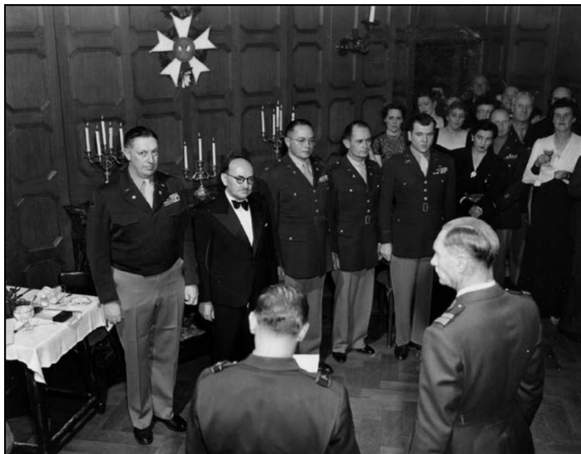
Captain Conein (fifth from the left) with others receiving the French Legion of Honor on 3 December 1947 at European Command Headquarters in Frankfurt, Germany.