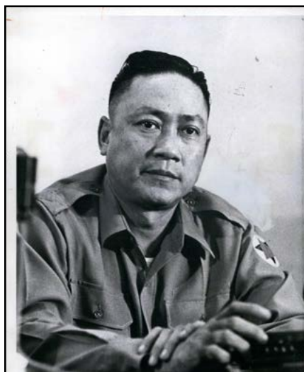
One of Conein’s senior contacts, Maj. Gen. Tran Van Don, had been a friend of Conein’s for 18 years.