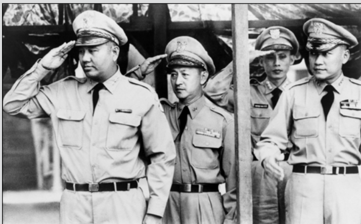
Maj. Gen. Duong Van “Big” Minh (left) with members of the military junta that replaced President Ngo Dinh Diem on 2 November 1963. Undated photo

As you well know when Lou Conein received his summons to report to the Joint General Staff Headquarters on 1 November