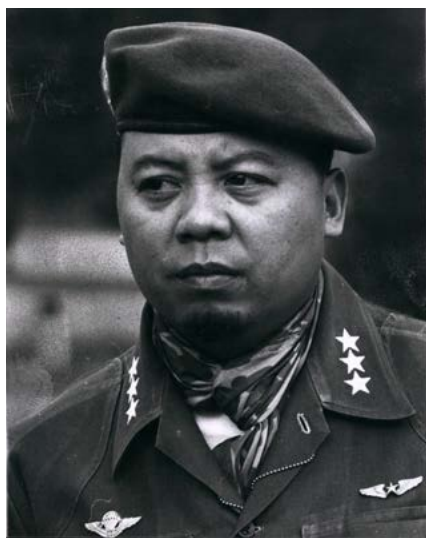
Maj. Gen. Nguyen Khanh, the military leader who would unseat the government of General Minh just three months after he had overthrown Diem.

Agency officials were apparently fed up with Conein’s drinking. After his return to Washington, CIA began the process of terminating its relationship with him. Yet a review of his records also suggests that his Agency colleagues wanted to reward Conein for many years of faithful service. A new personal services contract, effective 10 January 1968, authorized his participation in federal programs for retirement income, life insurance, and health benefits. Within weeks of that date, Conein filed for “retirement for medical disability,” which was approved in May. The official date for Conein’s resignation as a CIA