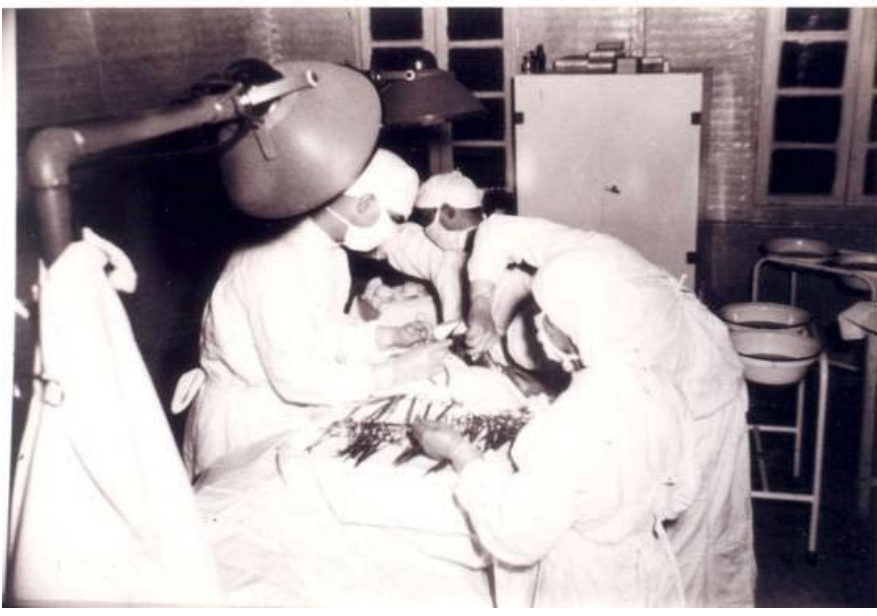
Nazira hospital operating room.

The corpsmen and medics did some of the most heroic Det 101 work, retrieving wounded while under fire . . .