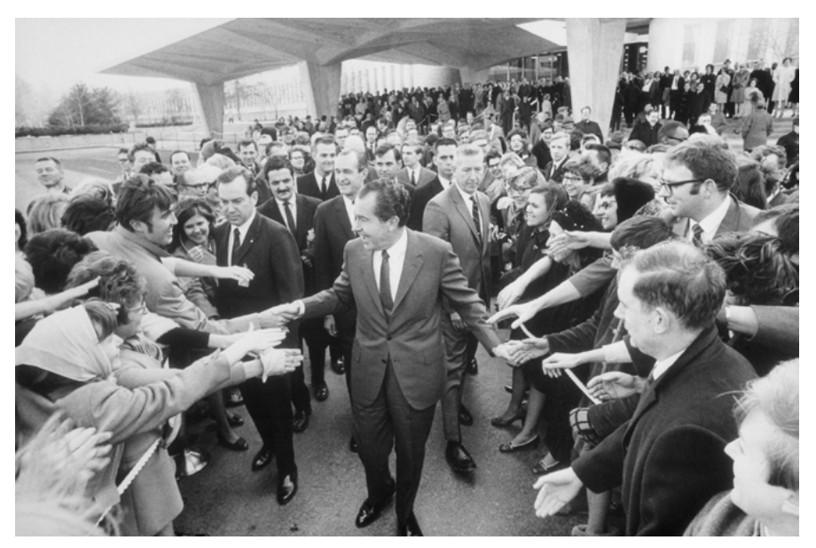
In a pleasant moment, President Nixon is shown here in March 1969 on his only visit to CIA Headquarters. He would, however, have a strained relationship with intelligence. His national security team pressed Intelligence Community leaders to find ways to better evaluate and improve the quality of IC analysis.

Nixon moved to address these perceived shortcomings in November 1971, issuing a directive covering the