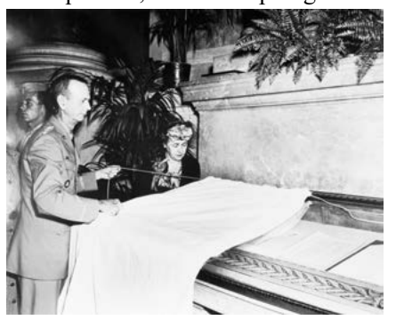
Gen. Jonathan M. Wainwright (1883–1953) unveils surrender documents at US National Archives exhibit, September 12, 1945.