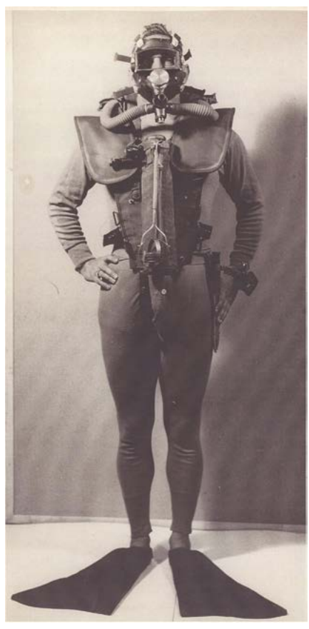
Diver wearing "Lambertsen's Lung."