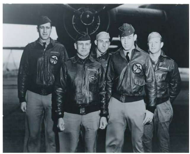
Lt. Col. Jimmy Doolittle (second from left) and the crew of the plane he piloted in the raids over Tokyo on 18 April 1942. Photo: escorted 10 French US National Archives. women to their

war criminals, they had been tortured, starved, and kept in solitary confinement. Three were executed, and a fourth died of starvation and disease. Of the four who remained, one was so near death from beriberi that he couldn't be included in the first group of POWs flown out. Lapsing in and out of consciousness, and becoming increasingly psychotic, he was treated by Jarman in a hotel room converted to hospital use until he became sufficiently stable to be moved to Kunming.<sup>15</sup>