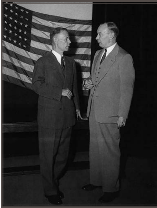
Gen. Walter Bedell Smith (left) relieves RAdm. Roscoe H. Hillenkoetter as Director of Central Intelligence in 1950.

years, saying that the CIA's global intelligence operations and procedures for forwarding information had made it possible to "keep the President informed better than ever before." In a rather backhanded compliment, Truman said he believed that "we have an intelligence information service now that I think is not inferior to any in the world." 2