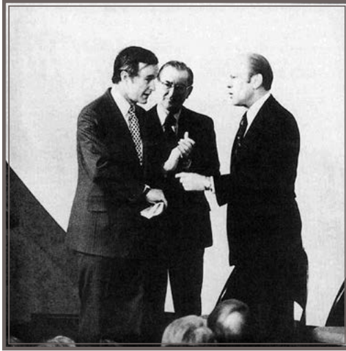
Former Ambassador George H. W. Bush receives congratulations from out-going DCI Colby and President Ford after his swearing in at the CIA Headquarters Auditorium.

Ironically, it would not be until Bush himself was in the Oval Office that CIA would again establish with a president a working relationship as fruitful as the one it had enjoyed during the first half of the Ford presidency.