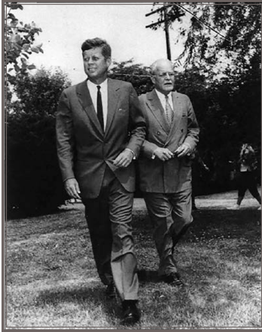
Sen. John F. Kennedy and DCI Allen Dulles prepare to meet the press.

based on a misunderstanding of what was included in the briefings he had given Kennedy.