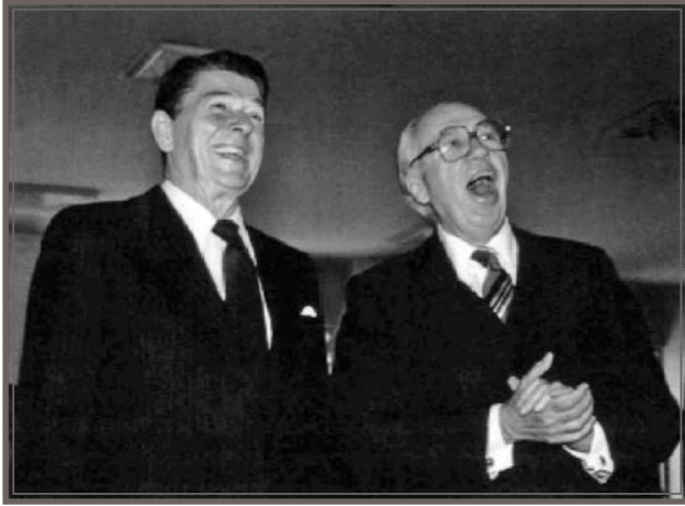
DCI William Casey's close relationship with Ronald Reagan during the campaign won him close and frequent access to the president.