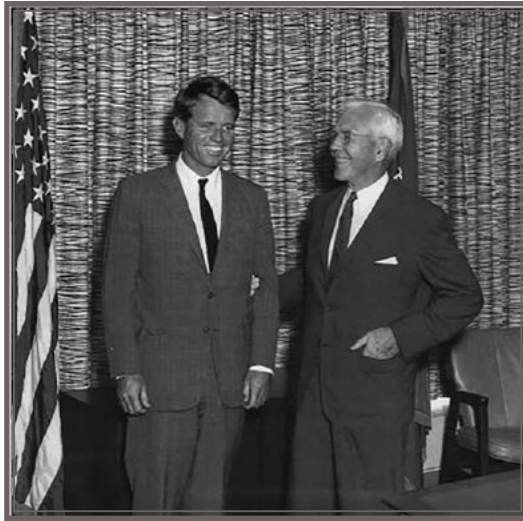
Attorney General Robert Kennedy and new DCI John McCone.

ber morning” that the international front was relatively peaceful and that there was nothing in the material McCone brought to him that required an immediate decision. 43