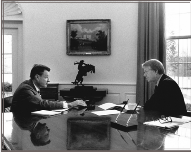
National Security Advisor Zbigniew Brzezinski and President Carter confer over the 21 January 1977 edition of the PDB..

The PDB Zbig brought to me each morning was a highly secret document, distributed to only five people...Zbig and I would discuss the report and other developments relating to defense and foreign affairs. Often, while he was still present, I would call the Secretary of State or the Secretary of Defense on a secure telephone to obtain additional information or get their opinions. They, too, were early risers, always at their desks by seven o'clock. 25