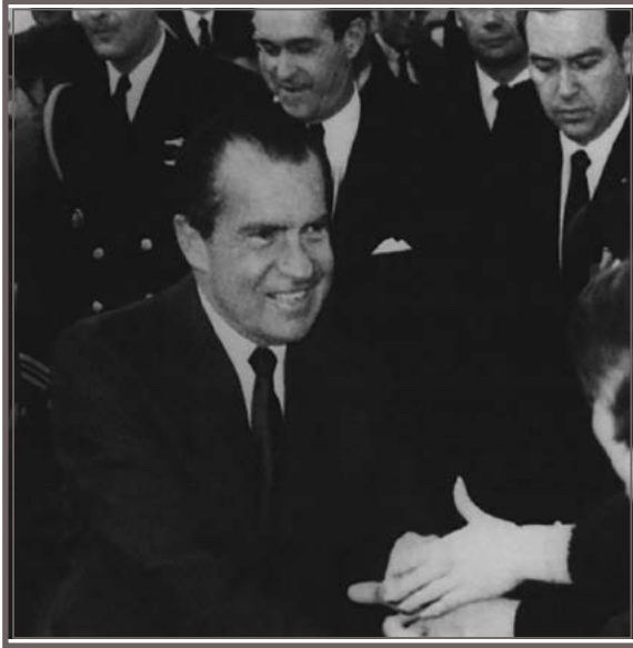
President Richard Nixon greets CIA employees as DCI Richard Helms looks on.

Czechoslovakia and the Soviet Union, events in the Middle East, and the military situation in Vietnam. 1 The director also discussed Cuba, including Castro's support for revolutionary efforts in Latin America, and events in the Dominican Republic and Haiti. Following Helms's briefing, Vance continued with a review of developments in the Paris peace negotiations that included details of the private talks under way between the United States and North Vietnam.