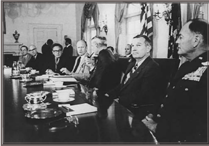
President Gerald Ford, flanked by Secretary of State Kissinger and Defense Secretary Schlesinger, presides over an NSC meeting. DCI Colby is seated at the far left.

ings in Chile. As the Rockefeller Commission and the Church and Pike Committees exposed more and more information about the Agency's real and imagined misdeeds, the director's standing with Ford weakened. Colby was not responsible for the sins of the past and, in fact, had ordered some controversial programs halted, but his handling of the issues—in particular, his failure to forewarn the White House of breaking embarrassments—caused Ford and Kissinger to lose confidence in him.