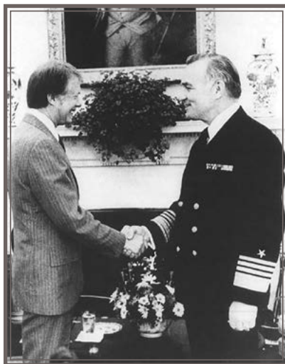
President Jimmy Carter welcomes DCI-designate Adm. Stansfield Turner to the Oval Office.

Bush underscored that if the president-elect felt he needed additional information he could, of course, contact CIA.