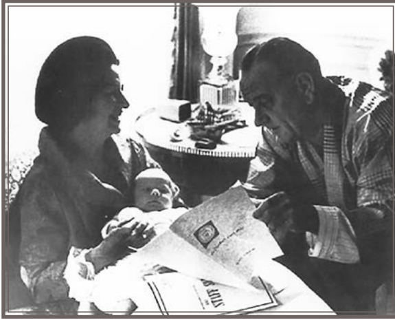
President and Mrs. Lyndon Johnson pose with their grandchild and a copy of the PDB.

son was holding their first grandson while the president was reading a copy of the President's Daily Brief .