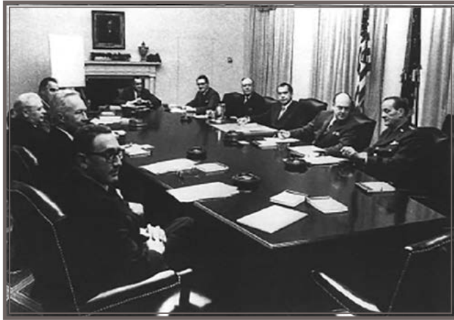
DCI Helms waits at the far end of the table to deliver his intelligence briefing to the NSC.

On one occasion the ambiguity about who was really speaking for whom was especially worrisome. A few days before the inauguration, Kissinger called Helms in Washington with a discouraging message. He said that the CIA director, following the inauguration, should brief the National Security Council on intelligence matters at the opening of its meetings but should then leave the meetings before the policy discussions. This scenario was represented by Kissinger as Nixon's idea, but Helms knew it was a ridiculous idea. Long experience had shown him that policymakers, during the course of their deliberations, frequently needed to turn to the representative of the Intelligence Community for factual updates.