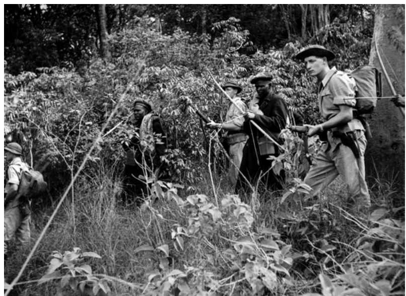
British and African soldiers on patrol during Mau Mau uprising. Date ca. 1951–55.