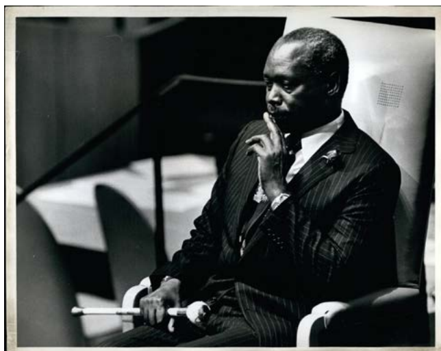
President Daniel arap Moi, Kenya's second president, addressing the National Assembly in 1981. He served during 1978–2002. He had been vice president for 12 years before that. Under his rule, Kenyan intelligence engaged in violations of human rights and other abusive practices.

Kenyan intelligence underwent changes during the 1980s, that reflected Moi's authoritarian methods and violations of human rights.