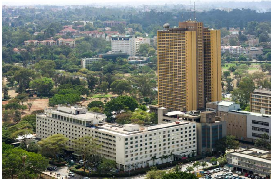
The Nyayo House in Nairobi became headquarters of Special Branch, whose leaders were consulted during construction.

As stories leaked out over the years, Nyayo House became known for torture and political suppression, which included arrests of students, professors, civil servants, and any