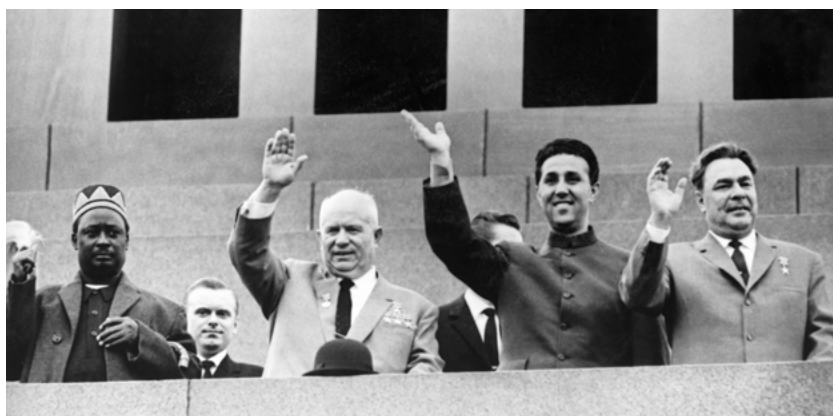
Oginga Odinga (left) during a 1964 visit to Moscow. To his left are Nikita Khrushchev, Ahmed Ben Bela, and Leonid Brezhnev. The trip gave substance to the fears of President Kenyatta. The children of both Odinga and Kenyatta would figure large in later Kenyan politics. Raila Odinga would spend time as a political prisoner and be tortured before becoming prime minister. Kenyatta's son was eventually elected president.