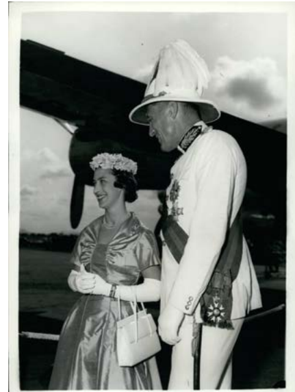
UK Princess Margaret on visit to Kenya, being received in Mombasa by Sir Evelyn Baring, 9 September 1956.

Colonial Kenyan Governor Sir Evelyn Baring publicly declared