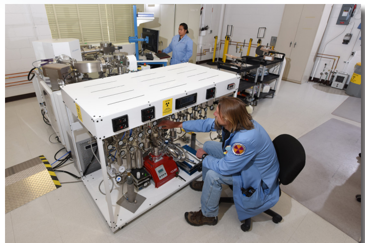
The Gas Mass Spectrometer in MFC's Analytical Laboratory helps researchers determine the chemical makeup of various samples.