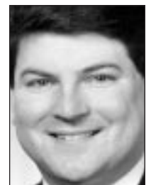
Representative Wayne Smith Delaware

All states require other documents with the driver's license application to prove the identity of a potential license holder. These documents vary from state to state and can include birth certificates, utility bills, passports, Social Security cards or licenses from other states. The challenge is to verify whether these documents are authentic. In many cases, it can be difficult to recognize authenticity. The Secret Service reported, for example, that the United States produces more than 16,000 different kinds of birth certificates.