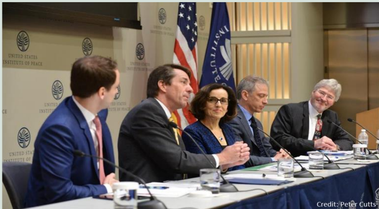
Figure 1. Federal panelists at the Unleashing American Innovation Symposium, held at U.S. Institute of Peace, Washington, D.C. on April 19, 2018.

As a Green Paper, this document provides a summary of key stakeholder inputs and identifies NIST findings that will help inform future deliberations, decision-making and implementing actions that could further enhance the U.S. innovation engine at the public-private interface. While development of this Green Paper was a productive way to have a dialogue, implementation of any of the NIST findings that would require specific policy, legislative, and/or regulatory actions must be considered, decided upon, and implemented by the relevant departments and agencies, including via formal established government processes. These processes include appropriate interagency review and in many cases formal public comment.