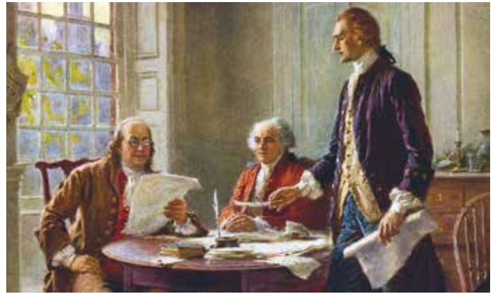
Benjamin Franklin, John Adams, and Thomas Jefferson in “Writing the Declaration of Independence, 1776,” by Jean Leon Gerome Ferris.

The Declaration of Independence lists three rights that the Founding Fathers considered to be natural and “unalienable.” They are the right to life, liberty, and the pursuit of happiness. These ideas about freedom and individual rights were the basis for declaring America’s independence. Thomas Jefferson and the other Founding Fathers believed that people are born with natural rights that no government can take away. Government exists to protect these rights. Because the people voluntarily give up power to a government, they can take that power back. The British government was not protecting the rights of the colonists, so the colonies took back their power and separated from Great Britain.