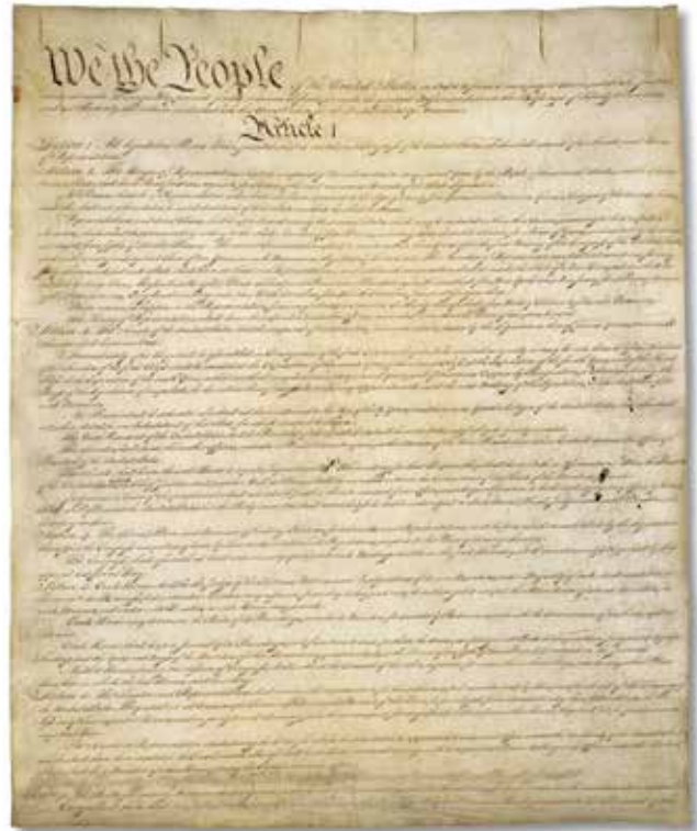
The Constitution of the United States.

The Constitution, written in 1787, created a new system of U.S. government—the same system we have today. James Madison was the main writer of the Constitution. He became the fourth president of the United States. The U.S. Constitution is short, but it defines the principles of government and the rights of citizens in the United States. The document has a preamble and seven articles. Since its adoption, the Constitution has been amended (changed) 27 times. Three-fourths of the states (9 of the original 13) were required to ratify (approve) the Constitution. Delaware was the first state to ratify the Constitution on December 7, 1787. In 1788, New Hampshire was the ninth state to ratify the Constitution. On March 4, 1789, the Constitution took effect and Congress met for the first time. George Washington was inaugurated as president the same year. By 1790, all 13 states had ratified the Constitution.