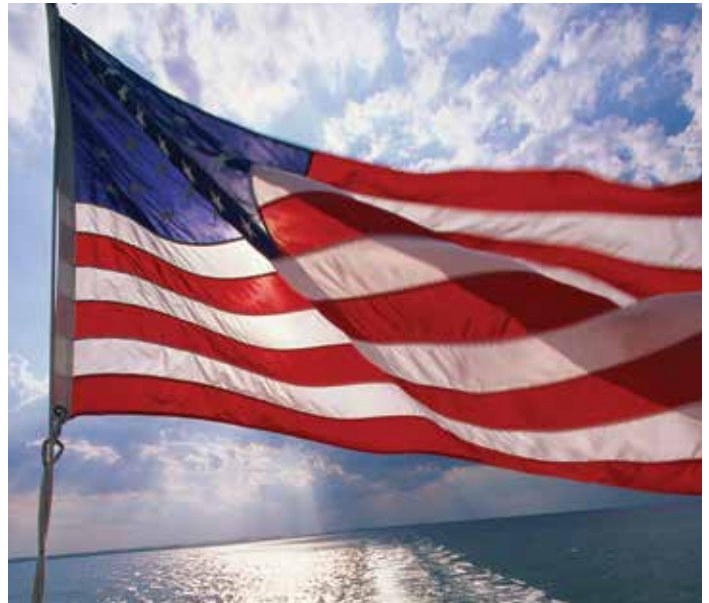
The American flag is an important symbol of the United States.

When the United States became an independent country, the Constitution gave Congress the power to establish a uniform rule of naturalization. Congress made rules about how immigrants could become citizens. Many of these requirements are still valid today, such as the requirements to live in the United States for a specific period of time, to be of good