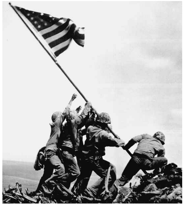
“Raising the Flag on Iwo Jima,”

From 1959 to 1975, United States Armed Forces and the South Vietnamese Army fought against the North Vietnamese in the Vietnam War. The United States supported the democratic government in the south of the country to help it resist pressure from the communist north. The war ended in 1975 with the fall of Saigon, the capital of South Vietnam. In 1976,