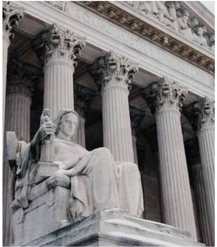
The Contemplation of Justice statue outside the U.S. Supreme Court building in Washington, D.C.

The judicial branch is one of the three branches of government. The Constitution established the judicial