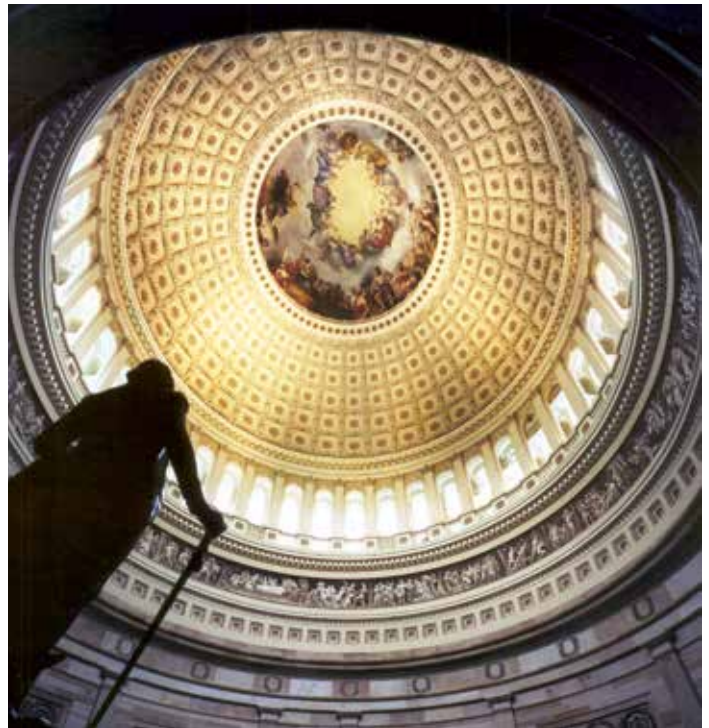
The Rotunda of the U.S. Capitol.

Congress is divided into two parts—the Senate and the House of Representatives. Because it has two “chambers,” the U.S. Congress is known as a “bicameral” legislature. The system of checks and balances works in Congress. Specific powers are assigned to each of these chambers. For example, only the Senate has the power to reject a treaty signed by the president or a person the president chooses to serve on the Supreme Court. Only the House of Representatives has the power to introduce a bill that requires Americans to pay taxes.