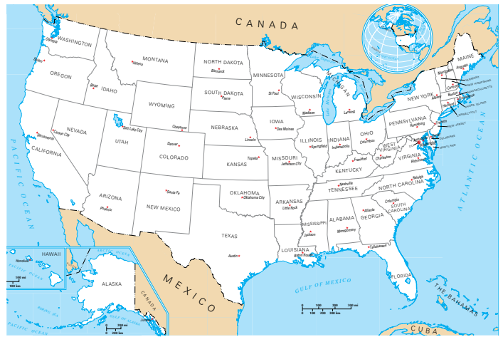
Map of the United States including state capitals.

The Constitution did not establish political parties. President George Washington specifically warned against them. But early in U.S. history, two political