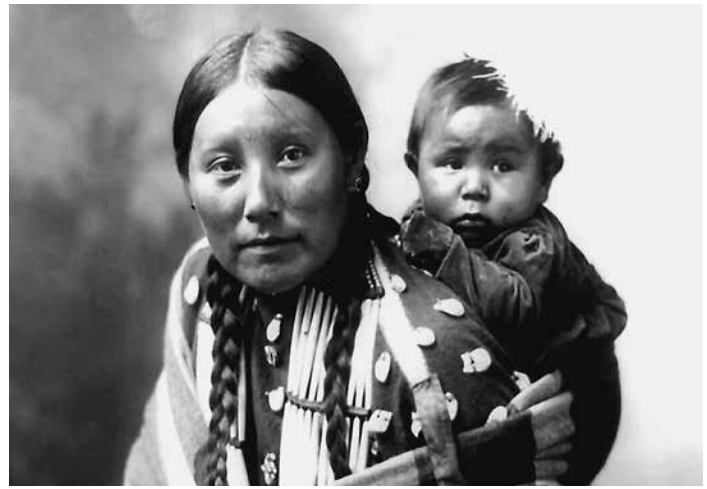
American Indian woman and her baby in 1899. Courtesy of the Library of Congress, LC-USZ62-94927.

On September 11, 2001, four airplanes flying out of U.S. airports were taken over by terrorists from the Al-Qaeda network of Islamic extremists. Two of the planes crashed into the World Trade Center’s Twin Towers in New York City, destroying both buildings. One of the planes crashed into the Pentagon in Arlington, Virginia. The fourth plane, originally aimed at Washington, D.C., crashed in a field in Pennsylvania. Almost 3,000 people died in these attacks, most of them civilians. This was the worst attack on American soil in the history of the nation.