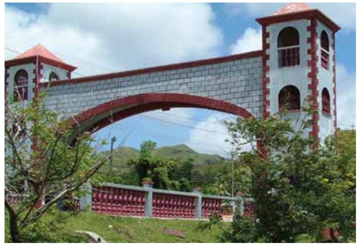
Old Spanish Bridge in Umatac, Guam.

The northern border of the United States stretches more than 5,000 miles from Maine in the East to Alaska in the West. There are 13 states on the border with Canada. The Treaty of Paris of 1783 established the official boundary between Canada and the United States after the Revolutionary War. Since that time, there have been land disputes, but they have been resolved through treaties. The International Boundary Commission, which is headed by two commissioners, one American and one Canadian, is responsible for maintaining the boundary.