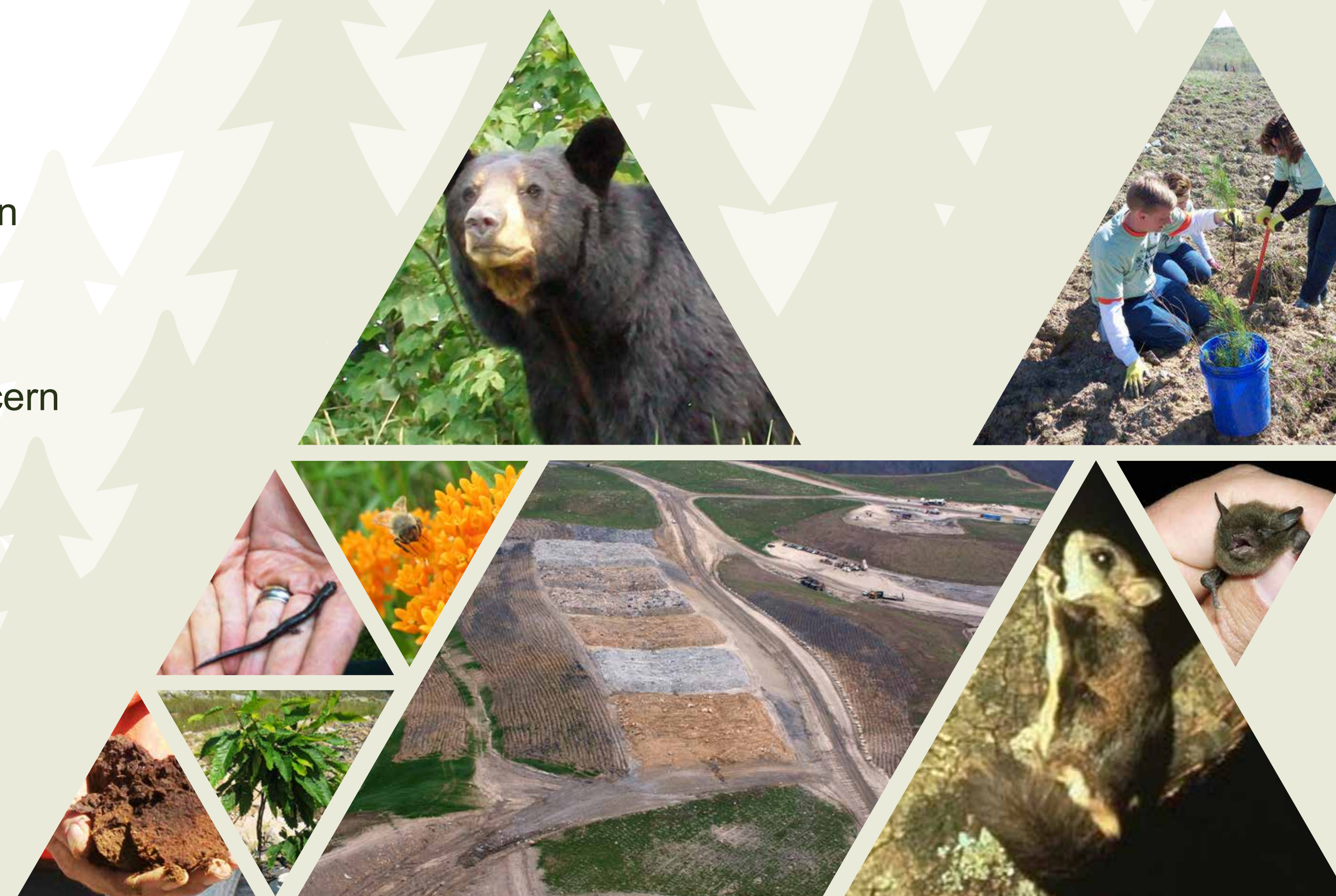
Mined land reforestation research conducted by the University of Kentucky.