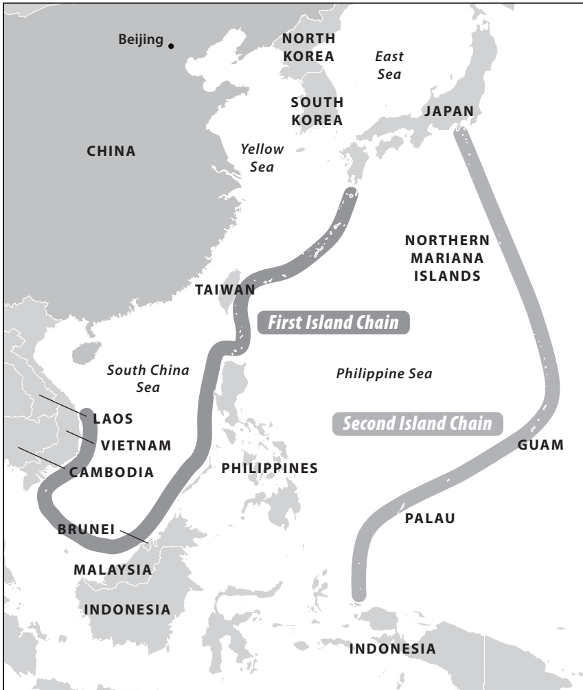
Figure 1: First and Second Island Chains