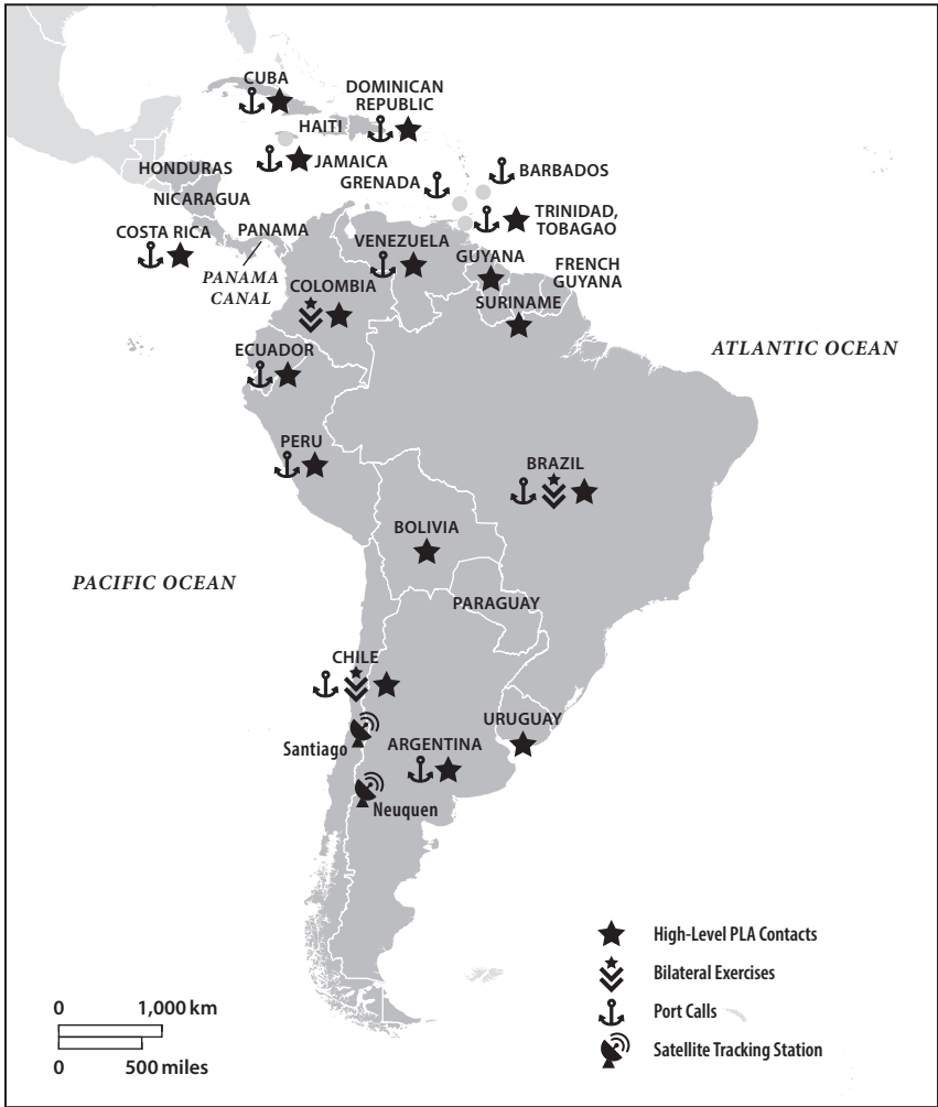
Figure 4: PLA Power Projection in the Atlantic Ocean and Western Hemisphere