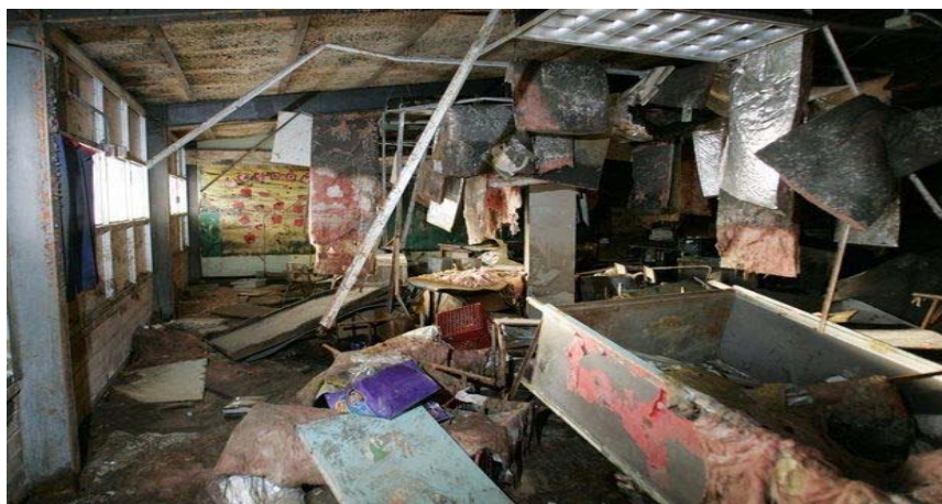
Figure 2: Damage to Joseph A. Hardin Elementary School

In 2008, RSD and the Orleans Parish School Board (OPSB) jointly developed the New Orleans Schools Facilities Master Plan (Master Plan) to rebuild school