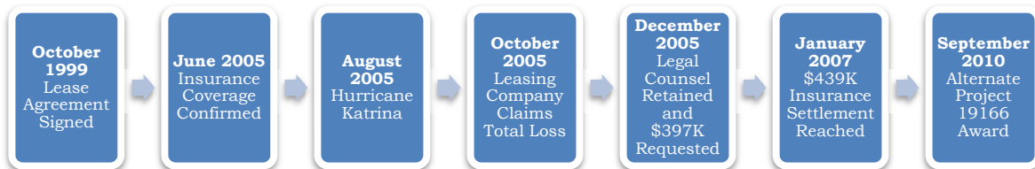
Figure 3. Timeline of Portable School Buildings from Lease to Award