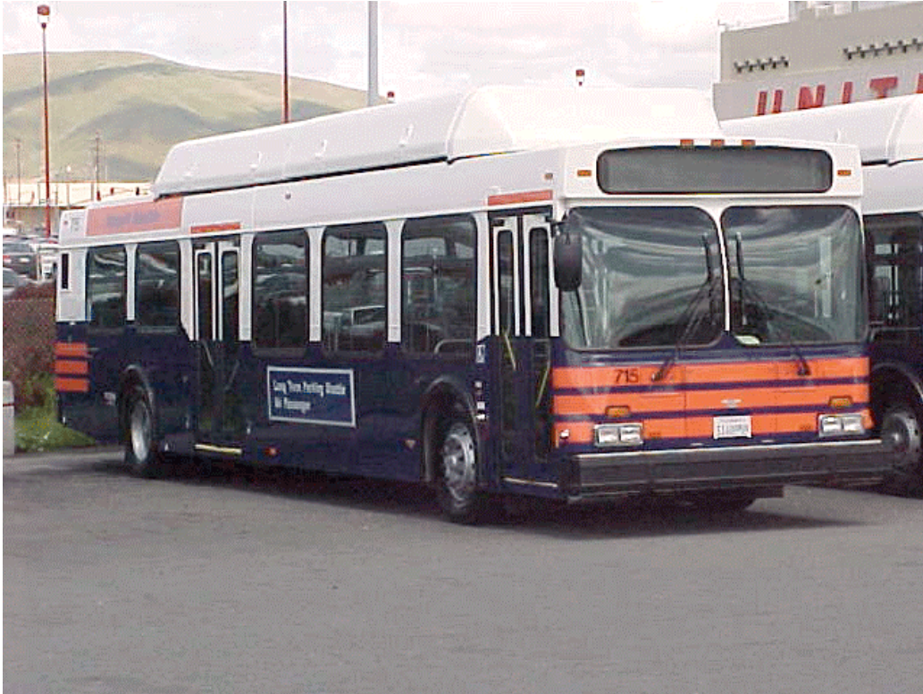
One of the four operating 40-ft. CNG buses for passenger service at SFO.