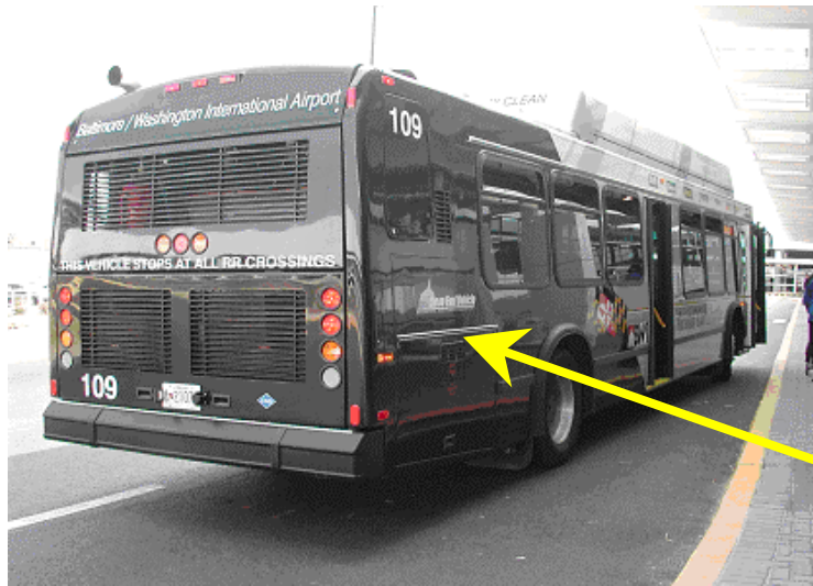
Current BWI CNG refueling station and a 40 ft. bus used for passenger service to parking lots.