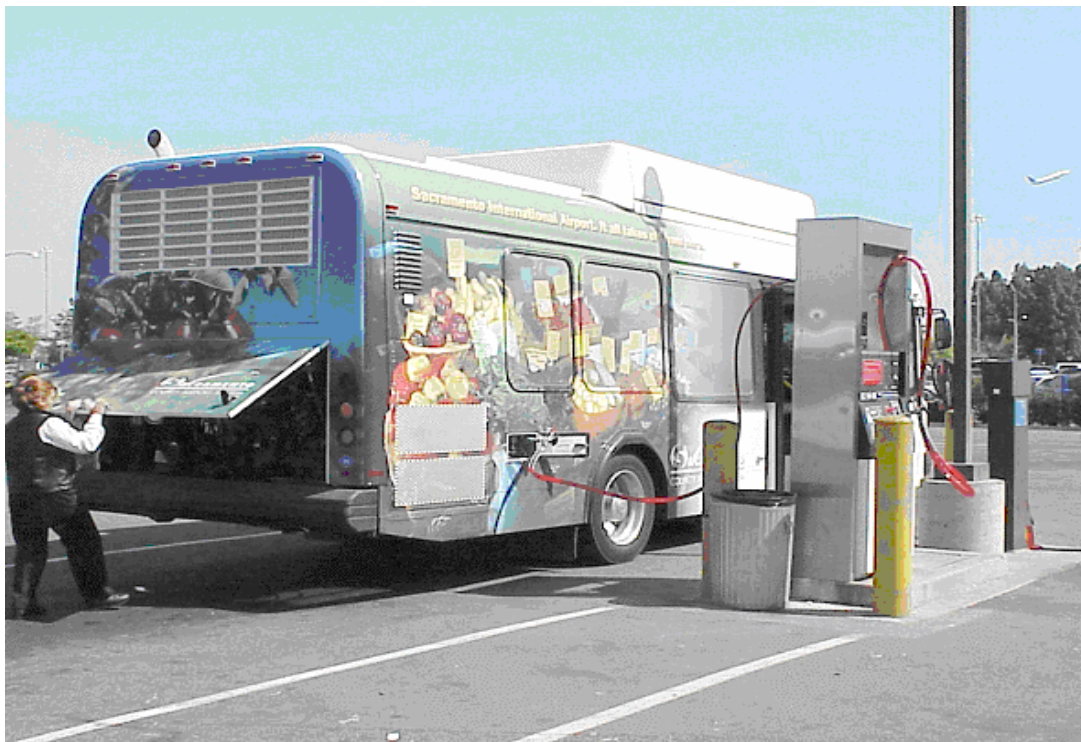
Refueling of one of the project’s 20 (30-35’) operating CNG buses.

AFV acquisition was complemented by investment in supporting infrastructure, including an upgrade to an existing CNG refueling station and several electric fast-charging systems.