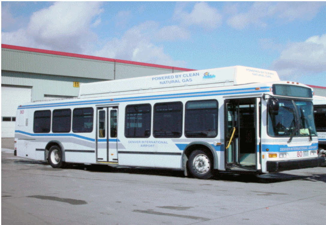
One of the 27 40-foot CNG buses in the project being used for passenger service at DIA.

The airport sponsor is using vehicle mileage and hourly usage data to more accurately assess annual and lifetime project emission savings. The sponsor also labeled vehicles, developed public information, and implemented CNG fuel maintenance and training.