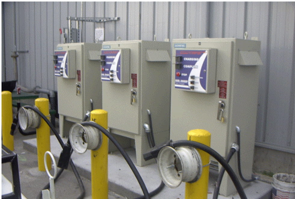
ETEC recharging stations for SkyWest electric GSE vehicles.