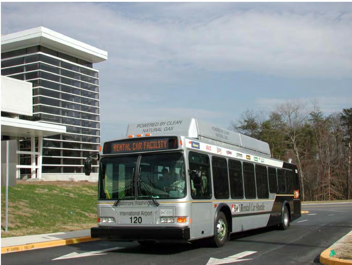
One of 25 40 ft. CNG buses that are shuttling the public and employees from airport parking lots to BWI terminals.

The car rental consortium at BWI is comprised of eight national car rental firms: Hertz, Avis, National, Alamo, Budget, Enterprise, Dollar, and Thrifty. The rental car companies collect customer facility charges to reimburse the airport sponsor for purchase of the buses. The Consortium is contracting with two companies (IMPARK and FleetPro) to operate and maintain the fleet.