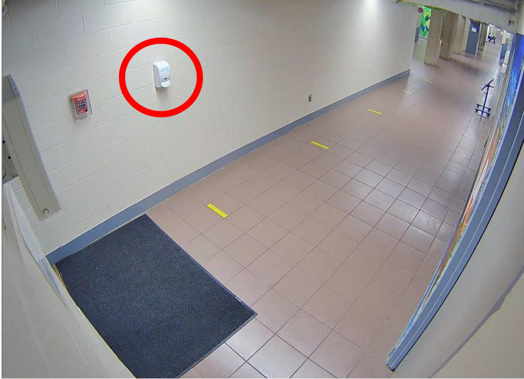
Photograph 2—Hand sanitizing station near entrance/exit doors (opposite wall).