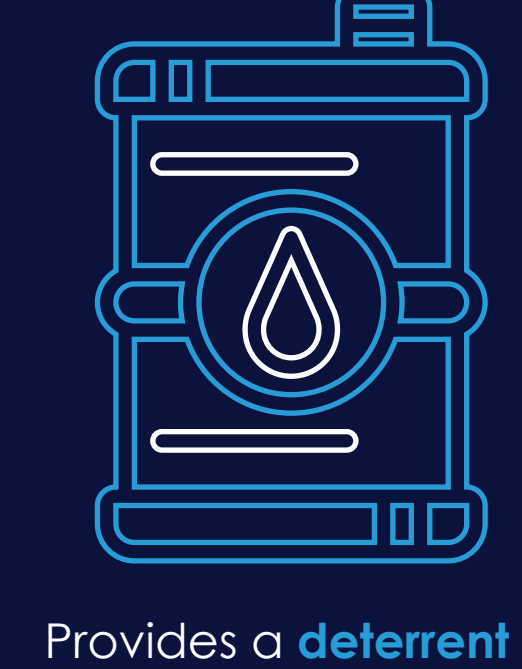
to hostile threats to cut off oil supplies