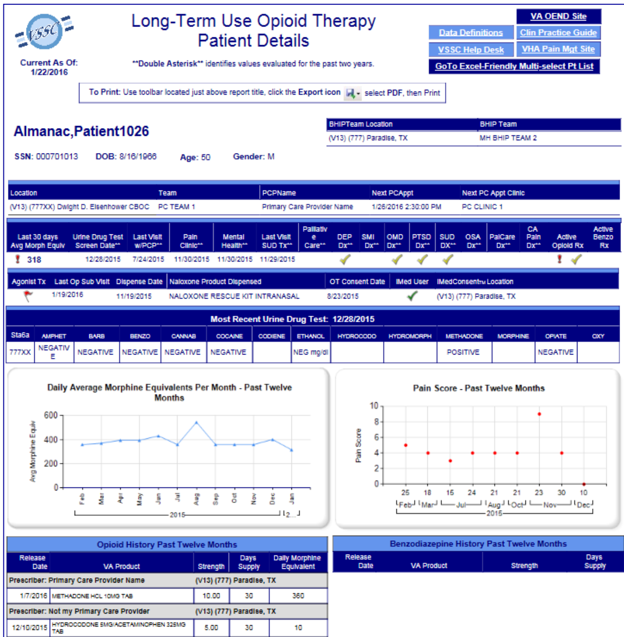
Figure 2: Example of OTRR Patient Detail Report. A detailed description of the information contained can be found in the following text.

Page 10 contains an example of an OTRR Patient Detail Report. The upper right corner contains several links to useful sites or resources; including: Data Definitions, VA OEND, VHA Pain Management, and a link to the 2010 VA/DoD Clinical Practice Guidelines for Chronic Opioid Therapy.