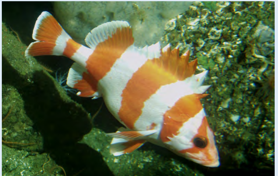
The California MPA network was, in part, designed to preserve connectivity for ecologically important rockfish.

The state's groundbreaking connectivity science was informed by data and models derived partly from commercially and recreationally important fish species, but is careful to consider and provide benefits to the wide range of species necessary to maintain the ecological integrity of California's marine ecosystems. While the design necessarily reflects tradeoffs and considerations of socioeconomic impacts, it is founded on ecological connectivity. California's MPA network provides a robust and evolving model of how connectivity can be explicitly, effectively, and continually applied to MPAs.