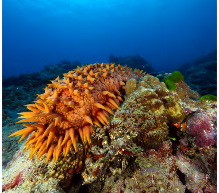
Oceanographic connectivity of larvae is vital to the spread of sessile and slow moving animals.

To effectively make the case for ecologically connected MPA networks, planners, stakeholders, and decision-makers need: (i) increased public awareness and prioritization of marine connectivity, both within and outside of MPAs, to enhance the health of the marine system and the ecological services it provides; (ii) a wider range of robust case studies illustrating the benefits, challenges, and opportunities of addressing connectivity in MPAs; (iii) clear, intuitive conceptual models of how ecological connectivity works, understandable to a variety of audiences; and, (iv) simple ecosystem-specific maps and interactive models illustrating the degree, directionality, and impacts of ecological connectivity in real places relevant to proposed or existing MPAs.