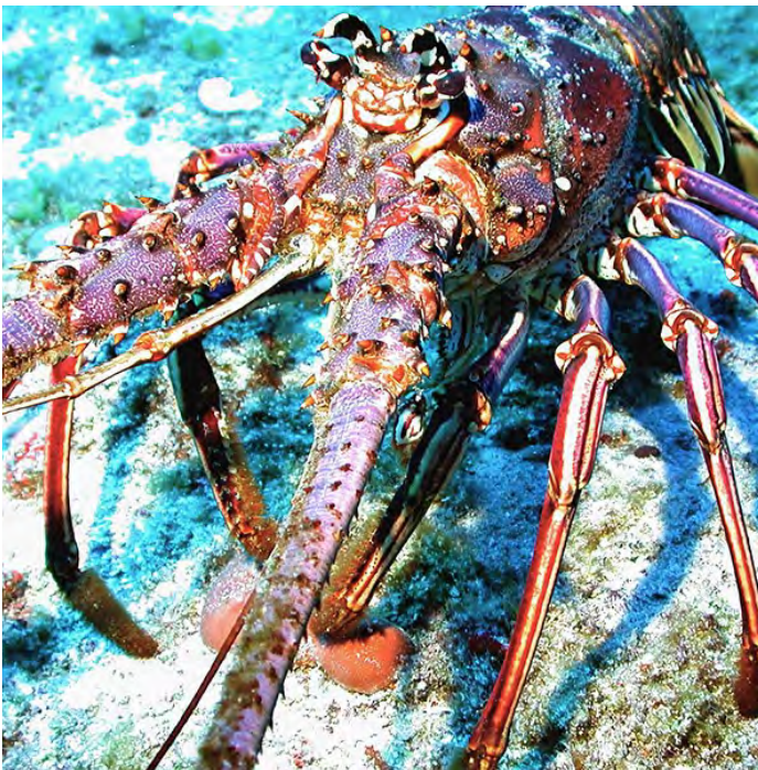
The breeding migration of Caribbean spiny lobsters is one of the strangest displays of connectivity on Earth.

The incorporation of connectivity into the design and management of MPAs and MPA networks presents challenges and limitations. The most robust techniques to document ecological connectivity require complex research efforts, such as genetics or tagging, that may be time- or cost-prohibitive. In addition, climate change can alter migration and larval dispersal pathways by changing ocean hydrodynamics, physiological processes, and the viability of specific habitats. Further, while the focus of connectivity in MPAs has typically been on economically important, charismatic, and/or highly mobile species (e.g., fish and marine mammals), successful implementation of measures to protect ecological connectivity will require improved knowledge of the ecology and connectivity of other species vital to ecosystem function, such as zooplankton, benthic invertebrates and plants, and other forage species. To successfully integrate connectivity into the design and management of MPAs, we must recognize these and other gaps and work to fill them.