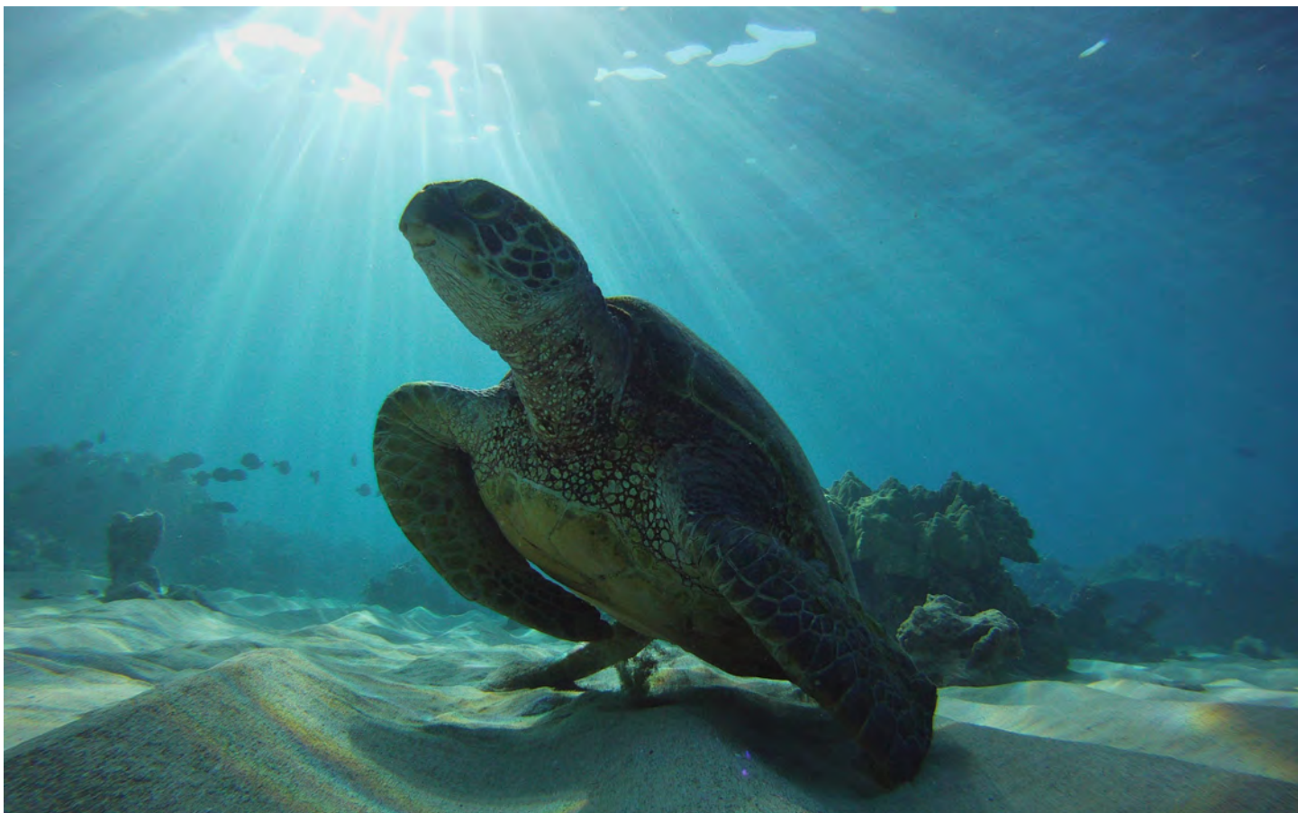
Green sea turtles can travel thousands of miles, connecting marine areas across the ocean.

Incorporating ecological connectivity into the design and management of MPA networks offers a powerful opportunity to leverage a fundamental and wide-spread ecological process. Broadening the focus of MPAs from the protected places themselves to include the ecological processes that sustain them over time is a crucial next step towards designing more effective MPAs and conserving the ecosystem services they provide. Through the explicit incorporation of ecological connectivity into MPA planning, the ocean community can begin identifying and enhancing the ocean corridors that sustain both MPAs and their surrounding ecosystems for this and future generations.