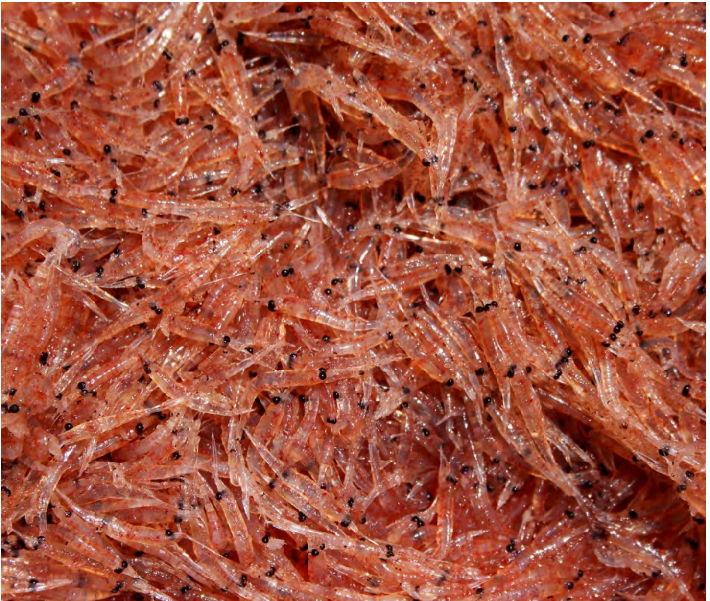
Improved understanding of the connectivity of lower trophic levels is an important information need.

To advance the collective knowledge about how, where, and when ecological connectivity affects MPA resources and ecosystems, there needs to be increased understanding of: (i) the role connectivity plays in different types of ecosystems and communities; (ii) the physical and biological processes that govern connectivity across multiple spatial (e.g., benthic-pelagic coupling in the deep sea) and timescales; (iii) how different trophic levels and/or life history stages contribute to connectivity among sites; (iv) the role of ecological connectivity in understudied species important to ecosystem function; and (v) how climate change may affect the drivers and consequences of ecological connectivity in various ecosystems.