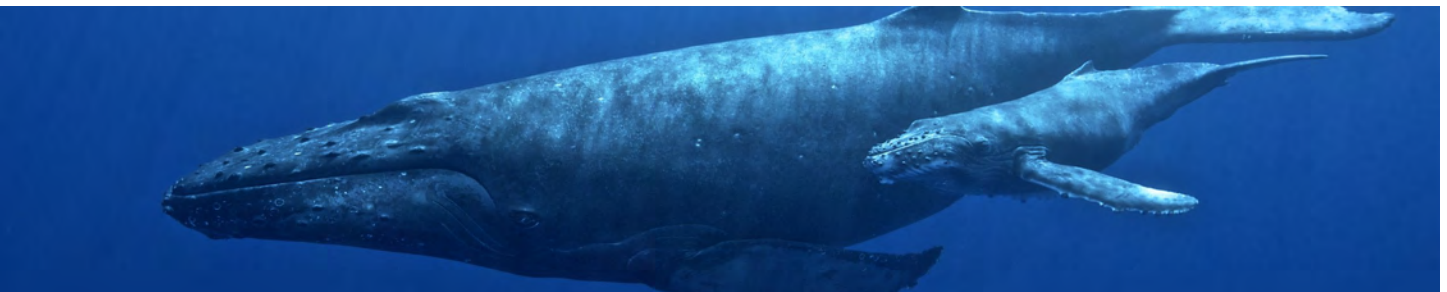
Organisms from tiny plankton to enormous whales create and benefit from connectivity.

Ecological connectivity , the movement of populations, individuals, genes, gametes, and propagules between populations, communities, and ecosystems, as well as that of non-living material from one location to another, is a fundamental ecological process (see Box 1). Effective ecological networks of MPAs are systems of core habitats connected by ecological corridors that are established, restored, and/or maintained to conserve biological diversity in systems that have been fragmented. These networks can be critical tools for sustainable ecosystem-based management. Their successful design and management depends, in part, on identifying, maintaining, and enhancing connectivity among distinct sites within the network. Enhancing ecological connectivity among MPAs improves conservation outcomes by promoting biodiversity, population persistence and resilience, increased capacity to adapt to environmental change, and sustainable fisheries management. 1-4 Well-connected networks of MPAs can also help species and ecosystems adapt to climate change by protecting climate refugia or providing a “safe landing place” for species undergoing range shifts. 5 Ultimately, integrating ecological connectivity into the design and adaptive management of MPA networks can improve conservation outcomes at individual MPAs and throughout the network while potentially reducing the footprint of its individual protected areas.