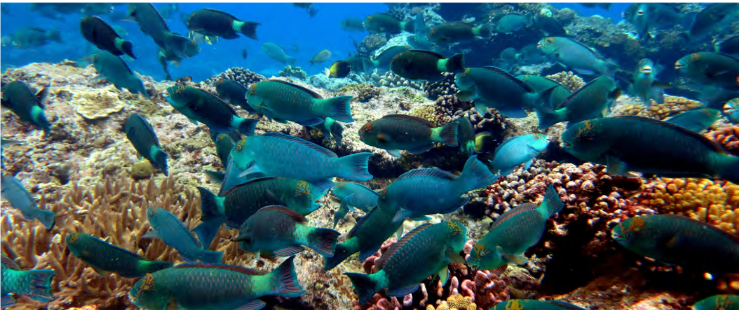
The movement of herbivorous fishes from reef to reef is important to ecosystem health.