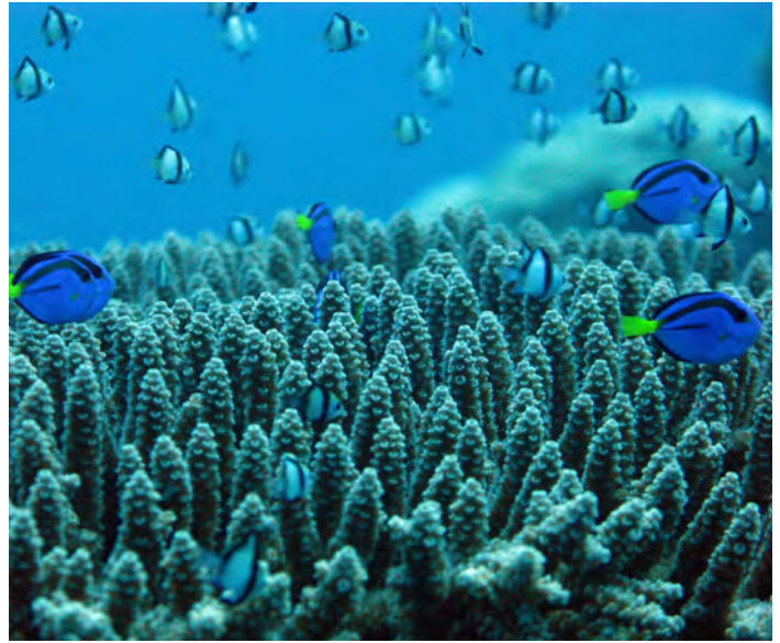
Preserving connectivity can enhance ecosystem resilience by allowing for recolonization after disturbance.

Much of our understanding of connectivity in protected areas is derived from the study of terrestrial areas where the processes creating ecological connectivity can be fundamentally different from those in the ocean. The biophysical nature of the marine realm and deep seas requires the development and application of a new body of knowledge about how to best ensure connectivity is maintained in the ocean. While an increased understanding of connectivity in the ocean will surely help leverage its benefits for MPAs and the surrounding ecosystems, in many situations we already have sufficient knowledge to more fully incorporate it into MPA design and management. Despite the growing evidence of the benefits of connectivity, a recent extensive examination of the application of connectivity in MPAs found that only 11% of MPAs across six global regions explicitly considered connectivity as part of site selection, and that 71% of those were either California State MPAs or Australia's commonwealth marine reserves. 4