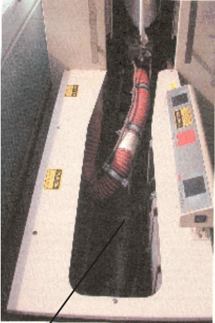
Opening at starting position with the buck inside the cabinet