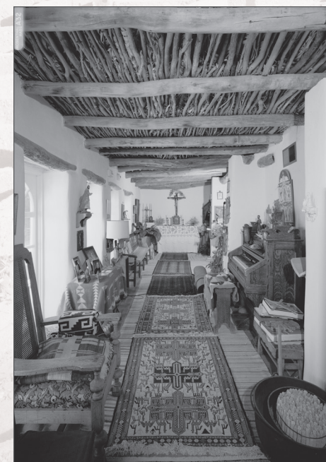
Barela-Reynolds House, Calle Principal, Mesilla, New Mexico; view of Oratorio, facing west, James Rosenthal, photographer, 2005. Erected of adobe bricks ca. 1850, this is one of the earliest structures built in this New Mexico border town following its takeover by the U.S. government in 1846.