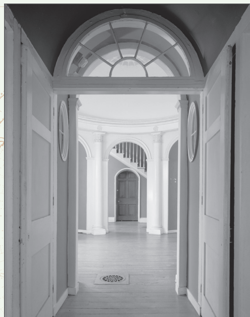
The Woodlands, Philadelphia, Pennsylvania; view from dining room service hall through doorway into entry vestibule; Joseph Elliott, photographer, 2003. Built between 1770 and 1789, this is one of the finest domestic examples of Neoclassical architecture in the nation.

Ellis Island, Statue of Liberty National Monument, New York Harbor, New York; Window Details, Contagious Disease Hospital Office Building; Luis Pieraldi and Paul Davidson, delineators, 2009. In 1892, Ellis Island opened as the first Federal immigration station; from 1892 to 1954, over twelve million immigrants entered the United States via this location.