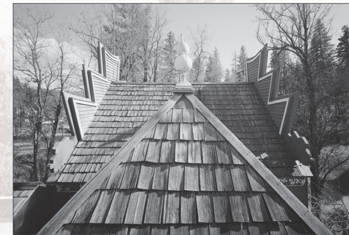
Weaverville Joss House, Weaverville, California; roof detail, Constructed 1873-1874, this is the oldest continuously used Chinese temple in North America and includes fittings imported from China. It was part of a settlement established by Chinese immigrants who came here to work in the gold mines.