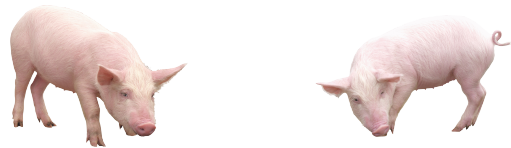
Figure 1. States participating in the NAHMS Swine 2021 Large Enterprise Study